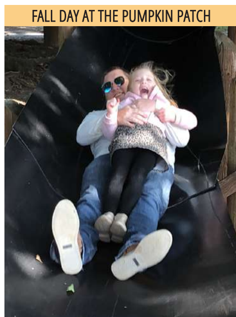
FALL DAY AT THE PUMPKIN PATCH