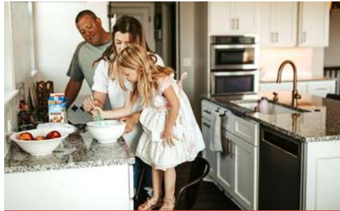
SUNDAY MORNING WAFFLE MAKING