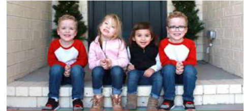
GINGERBREAD DAY WITH COUSINS

The best part about Christmas is that the journey to either grandmother's house (over the river and through the woods) is only about 30 minutes! We love living so close to all of our parents, grandparents, and siblings. With a total of 6 cousins under the age of 6, there will always be someone to chase around the dinner table or build blanket forts with. We always leave family gatherings with new memories and sore cheeks from laughing! Each of our family members hold a special place in their heart for adoption, either as an adoptive parent, a sibling, or an adoptee.