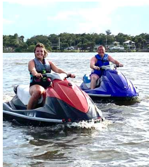
RIDING JET SKIS WHILE ON VACATION