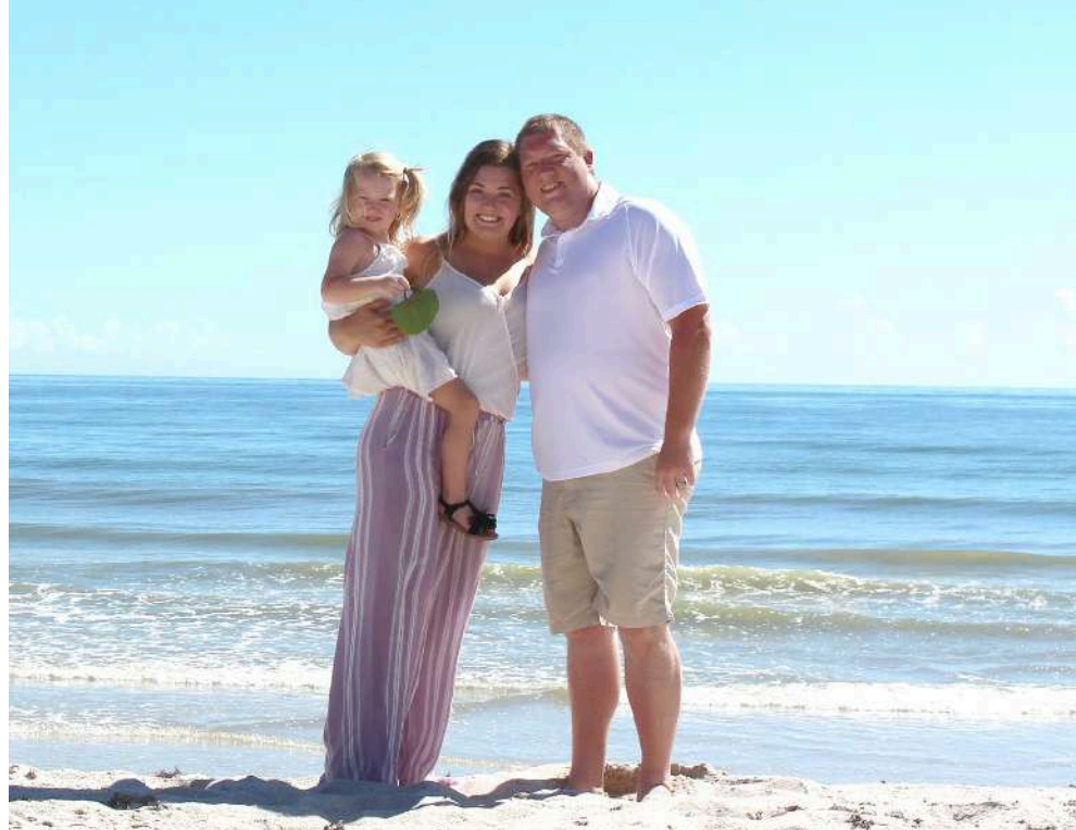
OUR FAMILY VACATION TO FLORIDA