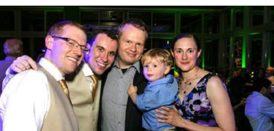
SPECIAL FRIENDS ON OUR SPECIAL DAY

ADOPTION: Your child will fit right in, having five other cousins who were also brought into our family through adoption. Adoption has always been openly talked about and celebrated in our families.