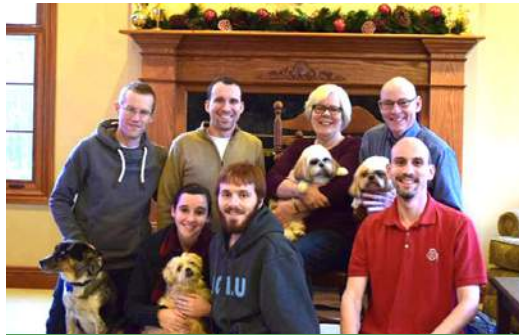
FAMILY TOGETHER FOR THE HOLIDAYS