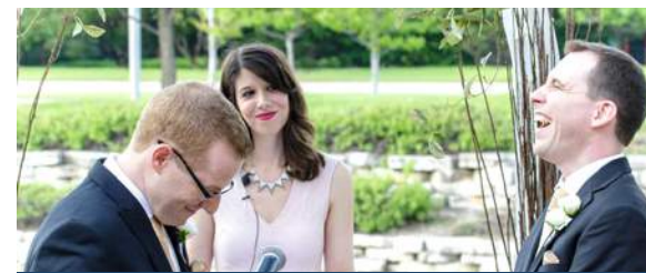
ALL SMILES ON OUR WEDDING DAY