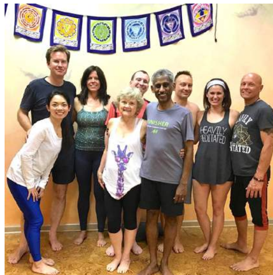
ADAM'S YOGA GROUP