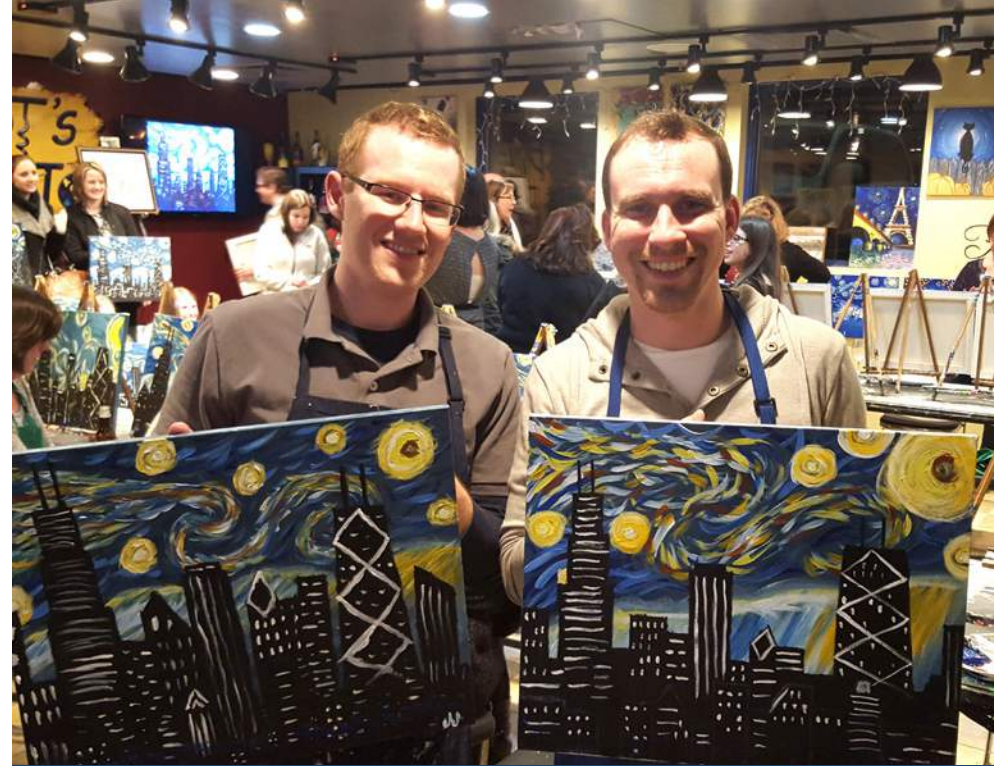
SHOWING OUR ARTISTIC SIDE