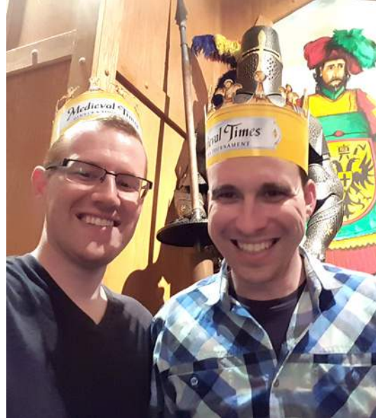
CHEERING ON THE YELLOW KNIGHT