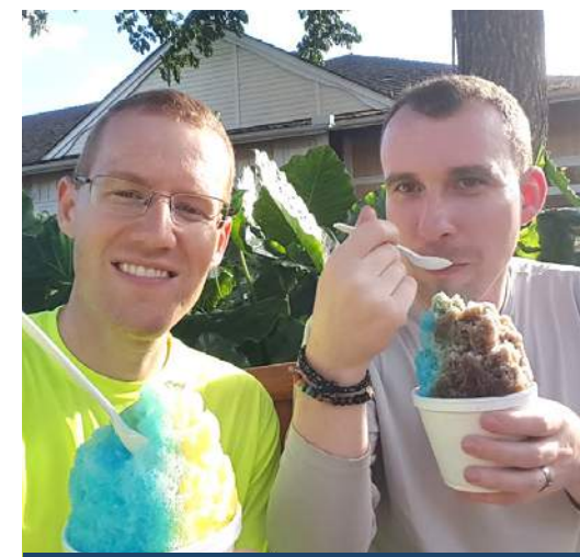
SHAVED ICE IN HAWAII!