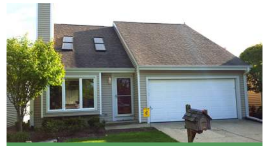
HOME SWEET HOME