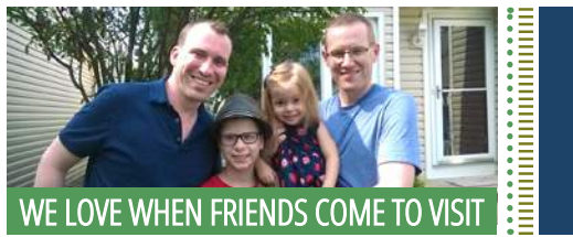
WE LOVE WHEN FRIENDS COME TO VISIT