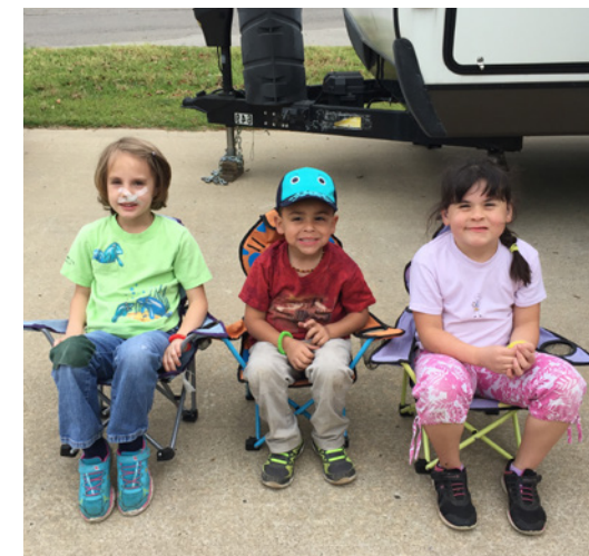
CAMPING - ALWAYS READY FOR THE NEXT THING!