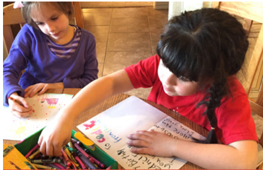
ALWAYS READY FOR A CRAFT