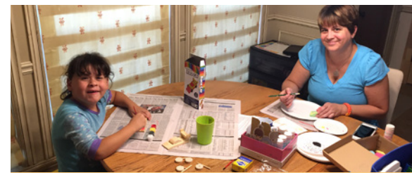
THE CREATIVE SIDE OF THE FAMILY