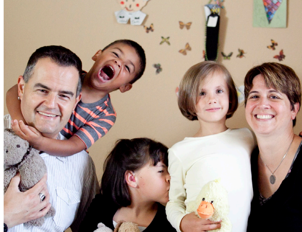
ANOTHER CHILD TO JOIN THE FUN (AND SILLINESS!) IS OUR DREAM