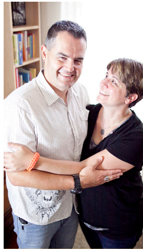
FRIENDS FOR LIFE

We like to read and sing songs together at bedtime. We enjoy cooking family recipes and arranging food attractively on the plates. We have several family traditions such as the coloring of Easter eggs by making dye with onion skins or the Swiss Saint Nicolas Day tradition of the "Grittibaenz", which is a funny looking home-made bread dough man.