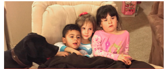
A GOOD MOVIE, WITH MUSHU THE DOG!