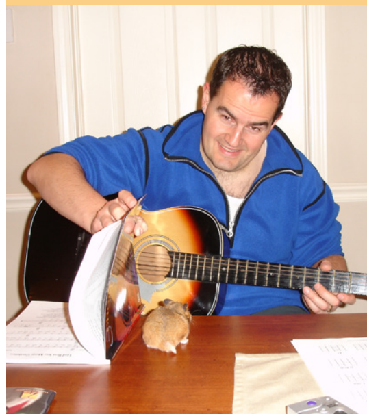
ATTEMPTING TO LEARN THE GUITAR