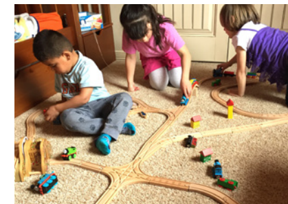
PLAYING TOGETHER - PRECIOUS MOMENTS