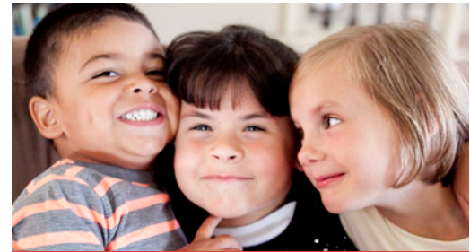
SO MUCH LOVE TO GIVE!