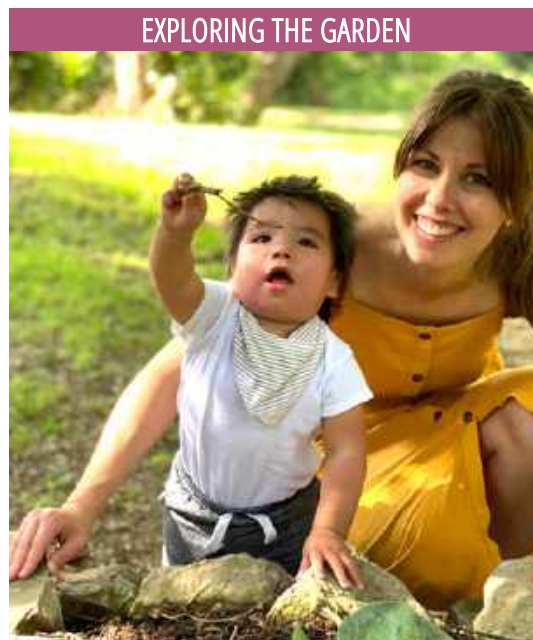
EXPLORING THE GARDEN