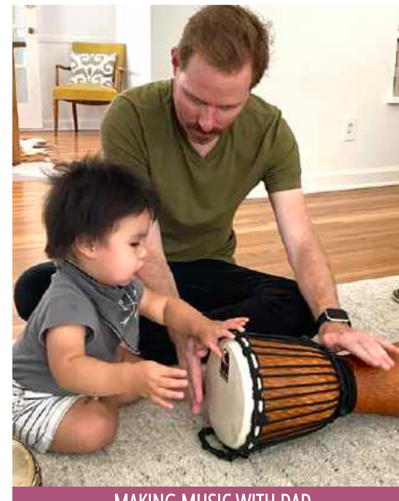
MAKING MUSIC WITH DAD