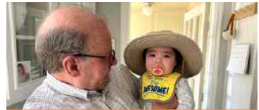
STEALING GRANDPA'S HAT