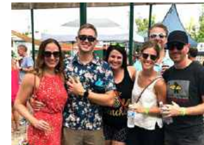
CHILI COOK OFF WITH FRIENDS