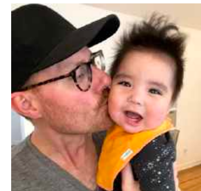
SILLY TIMES WITH DAD