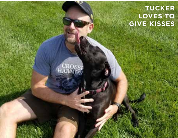
TUCKER LOVES TO GIVE KISSES