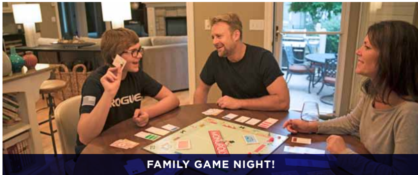
FAMILY GAME NIGHT!

Our neighborhood is a large subdivision with a pool, playground, walking trails, tennis courts, basketball courts, and a lake to go fishing! There are always activities throughout the year like fall festivals, 4th of July parade, and even pool parties. One of the best parts of our neighborhood is the schools. We have some of the best schools in the nation and the elementary school and middle school are just a couple blocks away. WE CAN'T WAIT TO SHARE ALL OF THIS WITH OUR FUTURE CHILD!