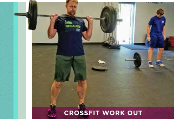
CROSSFIT WORK OUT