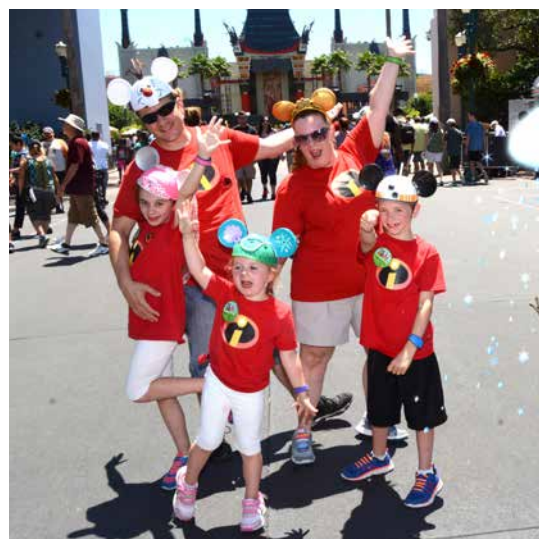
ENJOYING DISNEY MAGIC