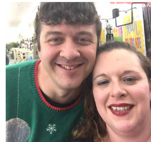
HOLIDAY DATE NIGHT