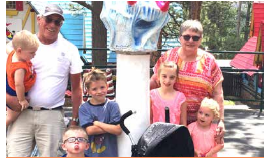
NORTHPOLE WITH GRANDPA AND GRANDMA