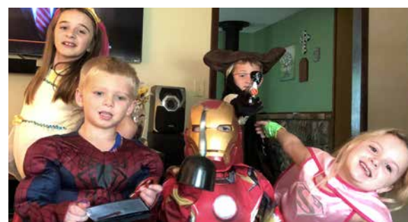
PROTECTED BY THE COUSIN AVENGER CREW