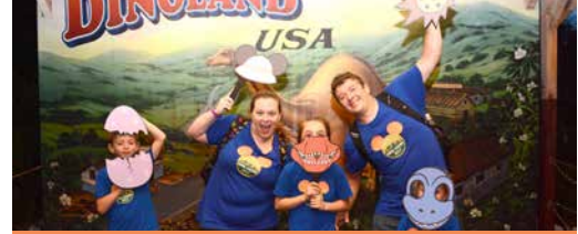
DINOLAND FAMILY FUN