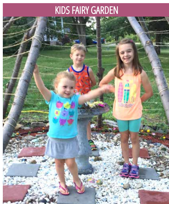
KIDS FAIRY GARDEN