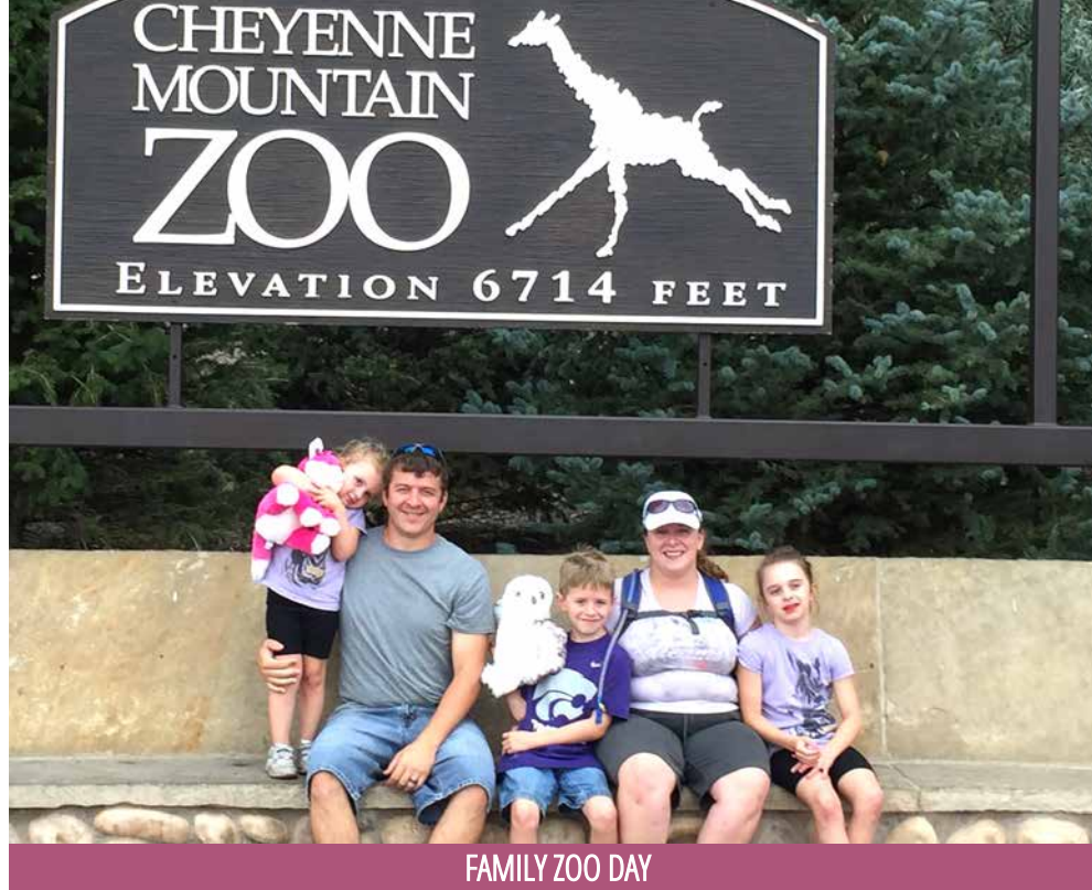
FAMILY ZOO DAY

We are praying as a family for you daily and cannot wait to meet you!