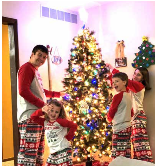
TRIMMING THE TREE 2018