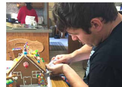
ANNUAL GINGERBREAD DECORATING