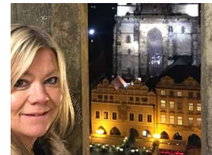
CASTLE STORIES TO TELL YOUR CHILD