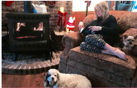
ENJOYING A BOOK BY THE FIRE