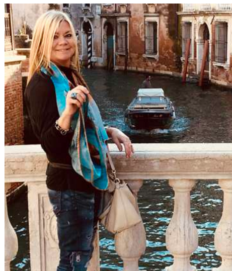
LIKE A FAIRYTALE!