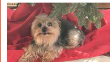
JJ'S CHRISTMAS DREAM