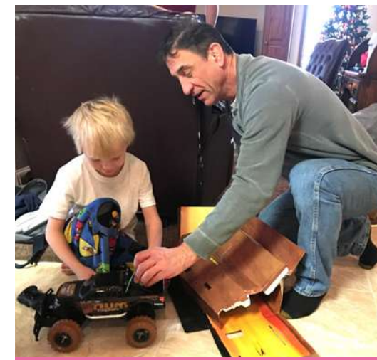
PRACTICING FOR FATHERHOOD