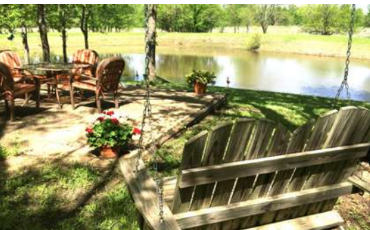
OUR SPECIAL PLACE

We raise free range chickens and gather their fresh eggs daily. It would be wonderful to have a little one tag along to gather eggs, feed the chickens, ducks, and fish, fill the wild bird feeders and put out corn for the deer who visit us.