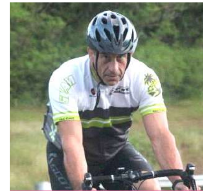
A HILLY 40 MILE RIDE IN GUAM