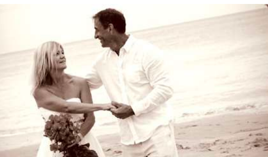
CELEBRATING A BRIGHT FUTURE TOGETHER