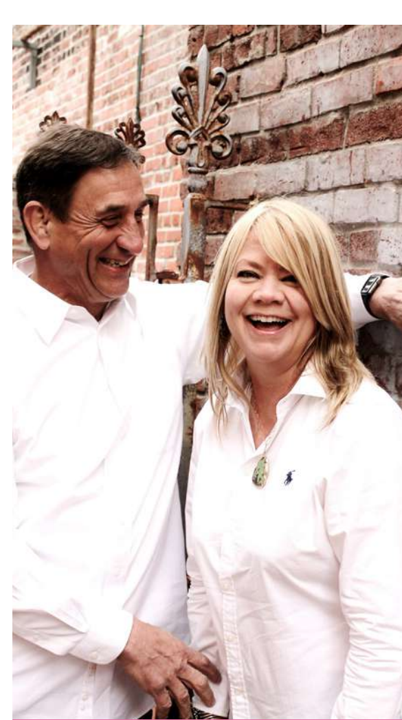
WE LOVE LAUGHING TOGETHER