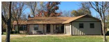
WELCOME TO OUR HOME!

Three of our friends recently had babies and are very excited for us to have a baby to join the play group! We are good friends with all of our neighbors and enjoy watching out for each other and having each other over for dinner and board games. Our home provides a great place to entertain and our friends enjoy coming out to see us and relax by our pond.