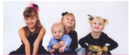
READY FOR A NEW COUSIN!