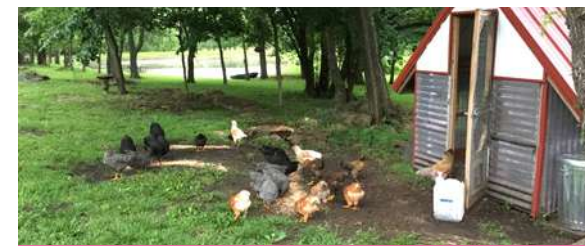
WE ALWAYS HAVE PLENTY OF FRESH EGGS!