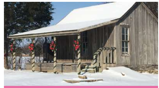
OUR LITTLE CABIN