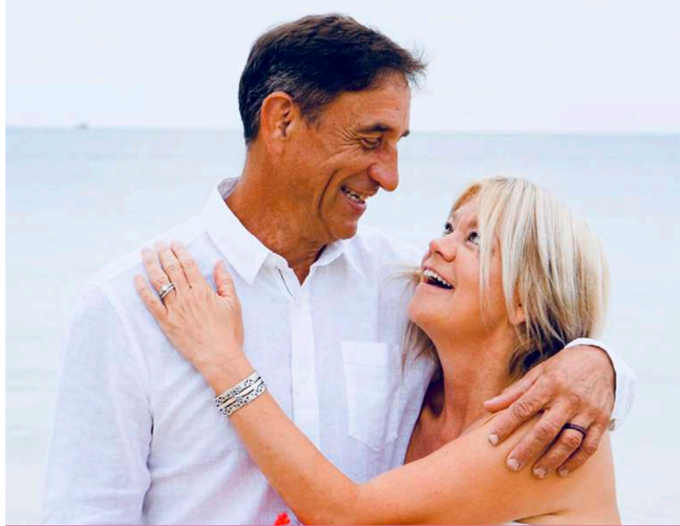
I LOVE YOU!

To help fund some travel we both decided that since we love kids so much we would substitute teach. We choose which days we teach and get to work with children from Kindergarten to high school. We plan to stop teaching once we have a child in our family so we can devote our time to raising this very special child.