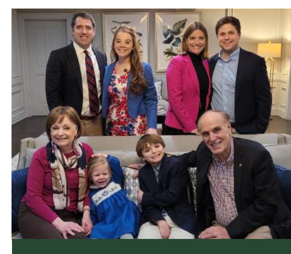
GRANDDAD'S BIRTHDAY DINNER