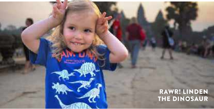
RAWR! LINDEN THE DINOSAUR