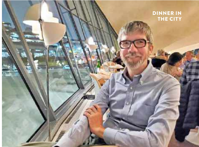
DINNER IN THE CITY