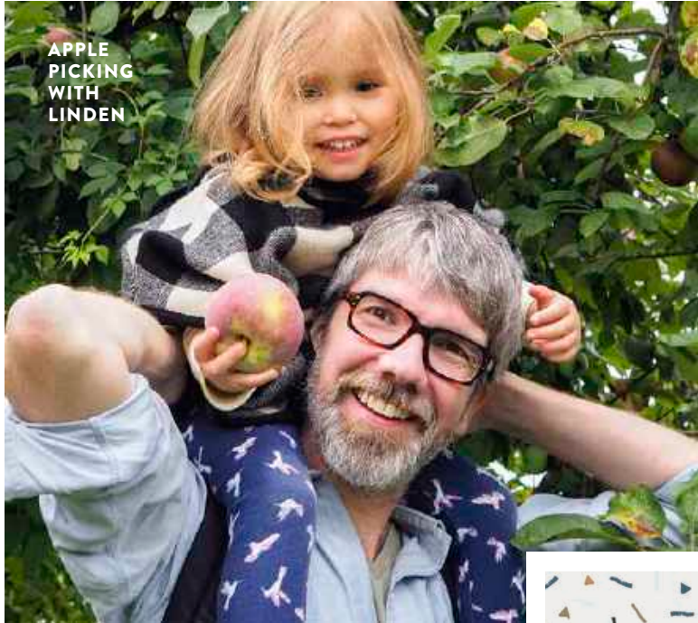
APPLE PICKING WITH LINDEN