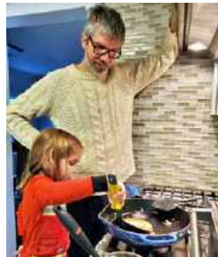
SATURDAY MORNING PANCAKES