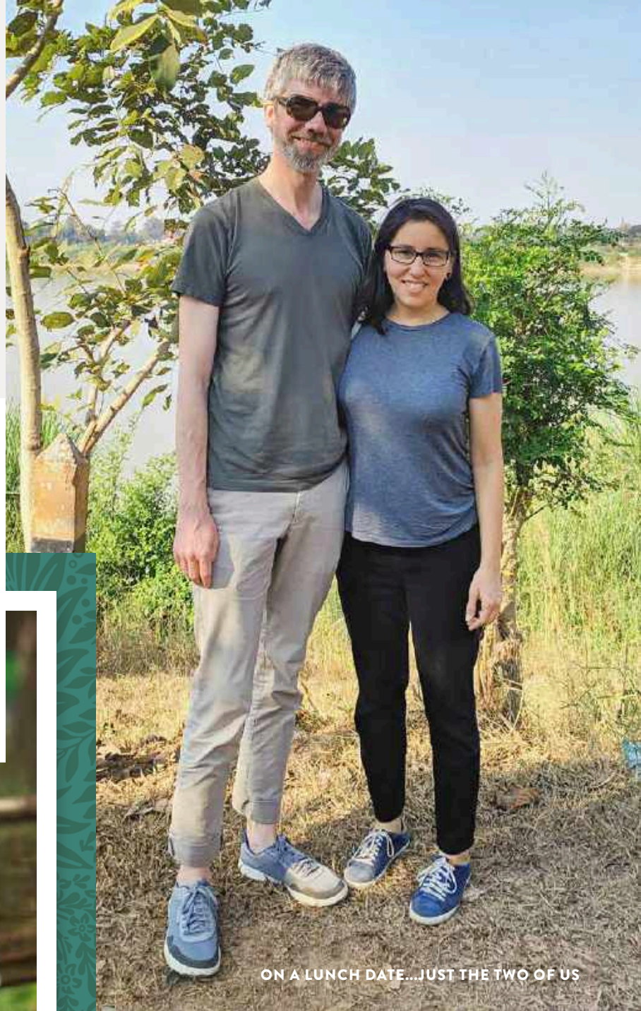
ON A LUNCH DATE...JUST THE TWO OF US