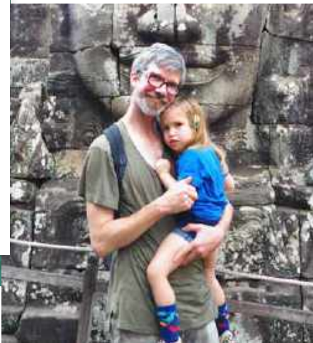
TAKING A BREAK FROM THE TOUR FOR A CUDDLE WITH DAD