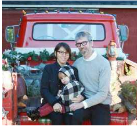
WE LOVE CHRISTMAS