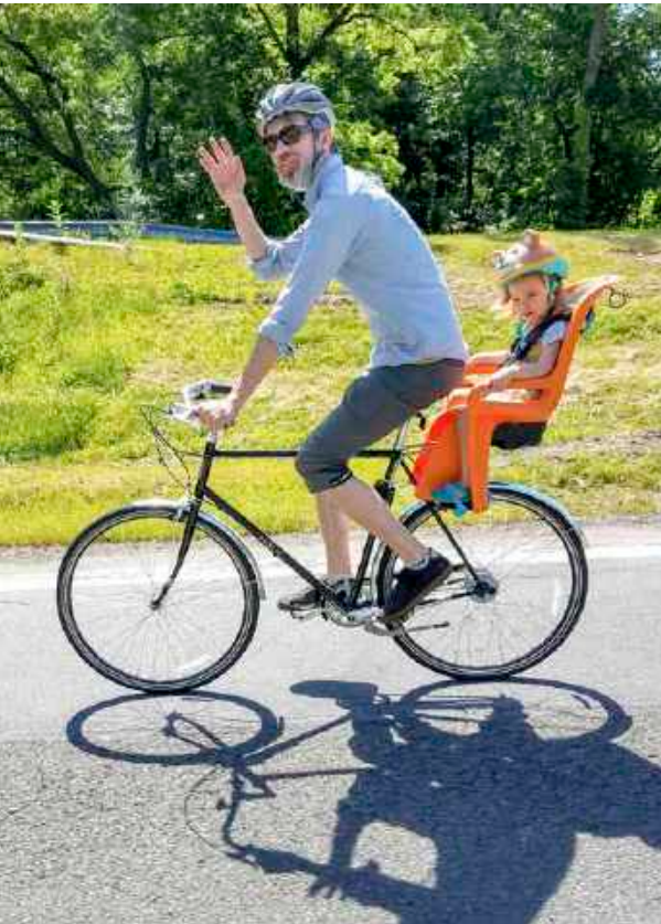
WE LOVE TO RIDE OUR BIKES