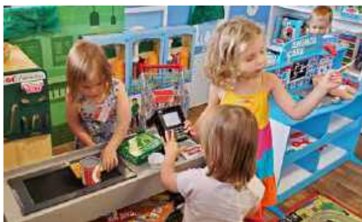
▶▶▶ COUSINS PLAYING GROCERY STORY