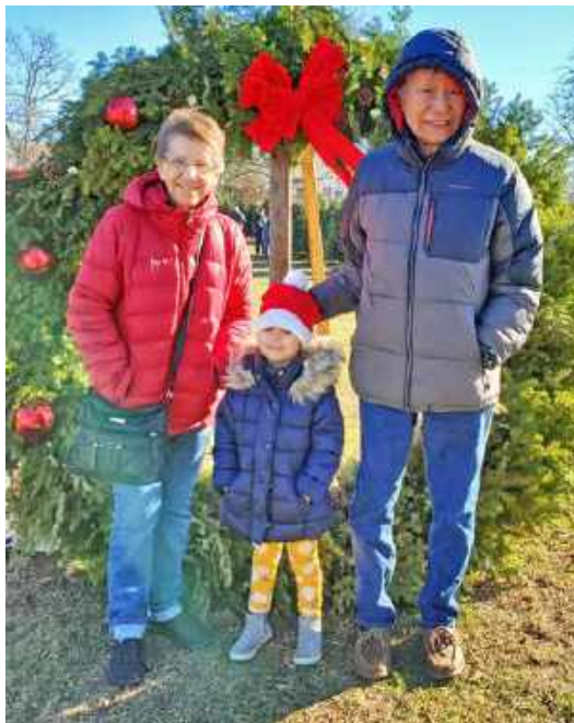
THE WHOLE FAMILY LOVES CHRISTMAS