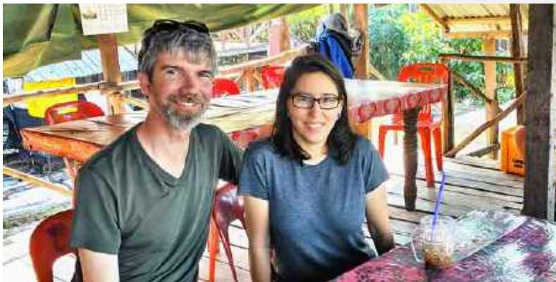
☐☐☐ COFFEE AND DONUTS