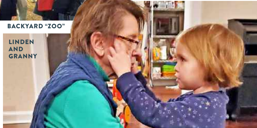
LINDEN AND GRANNY