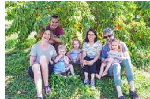
APPLE ORCHARD TRIP