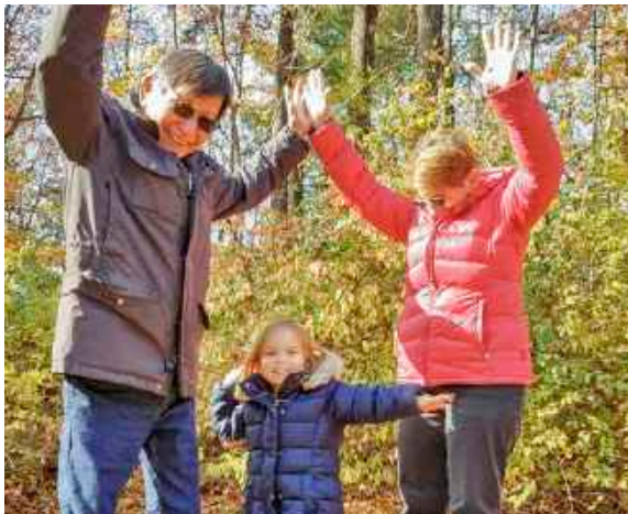
JUMPING FOR JOY!