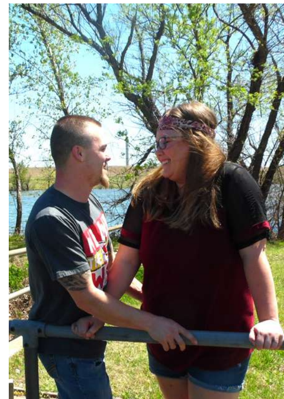
THE LAKE...OUR HAPPY PLACE!