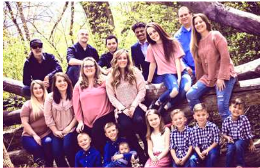
OUR FAMILY IS ALWAYS TOGETHER!