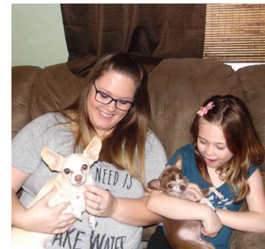
ALWAYS LOVING OUR PUPS