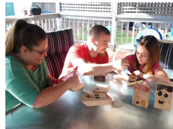
WE ENJOY FAMILY ACTIVITIES ON OUR DECK