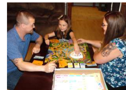
OUR WEEKLY GAME NIGHT