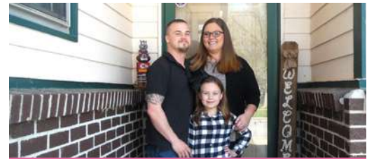
WE CANT WAIT TO LOVE ANOTHER BABY