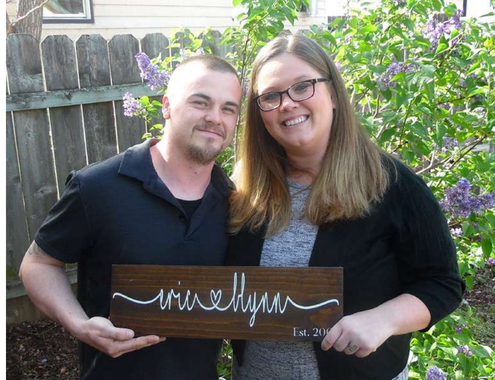
WE'VE BUILT SO MUCH TOGETHER THE PAST TEN YEARS