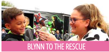
BLYNN TO THE RESCUE

Eva: A Chihuahua who is 13. She may be the oldest but she still acts like a puppy.