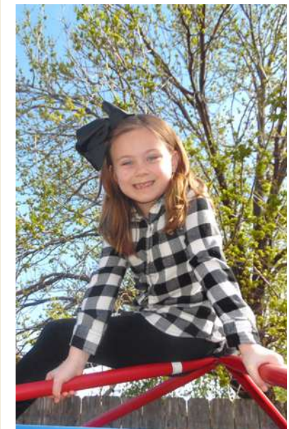
A BACKYARD FAVORITE!