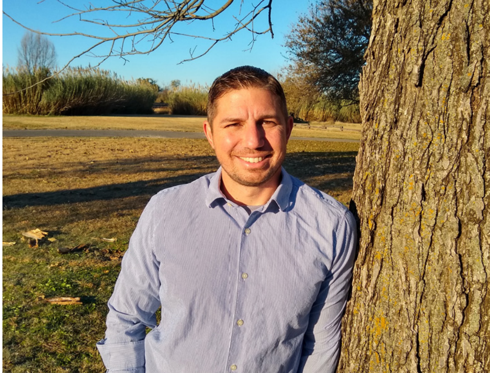
ENJOYING OUTSIDE IN SMALL TOWN AMERICA

My recent past has reinforced my deep desire to have a family. In 2013, I began dating a woman with three children, the youngest of which was two. Early on, I began to consider these children as my own, and in 2017, we got married. Unfortunately, as sometimes happens, the marriage did not work and we divorced in early 2019. As many other step-parents have discovered, after the divorce, I lost all legal rights to see the kids that I had loved and helped raise for 5 years. While my heart broke with the realization I would never be able to shoot baskets with my step-son again, or dance with my step-daughter at another "Daddy-Daughter Dance," my hope is my heart will be full once again if I am fortunate enough to adopt your child.