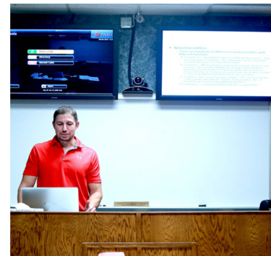
TEACHING COLLEGE PSYCHOLOGY