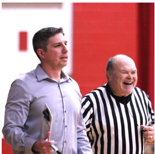
COACHING HIGH SCHOOL BASKETBALL