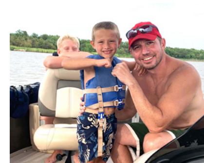
ENJOYING BOATING WITH FRIENDS AND THEIR CHILDREN