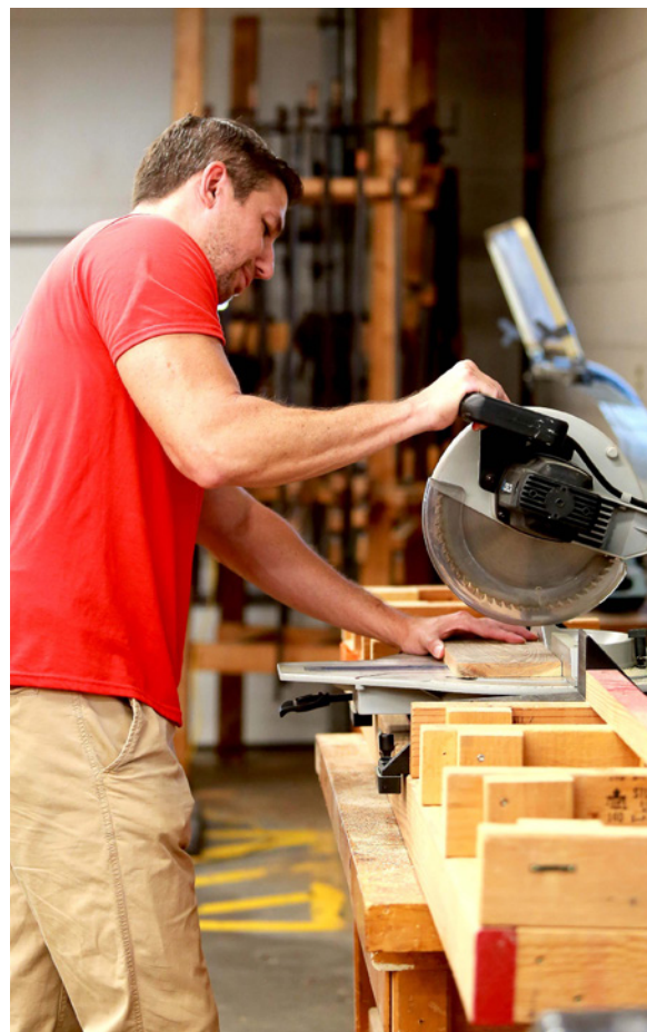
WORDWORKING HAS BECOME A NEW HOBBY

➤ In an effort to be more in touch with my Mexican heritage, I am also learning Spanish. My Dad speaks fluent Spanish and I would love to be able to not only speak with him, but pass on a second language to my child.