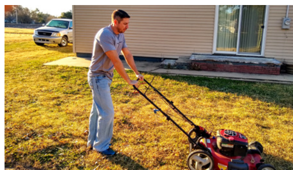
YARD WORK BUILDS CHARACTER!