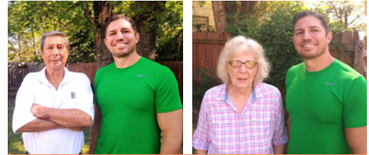
ME WITH MY PARENTS