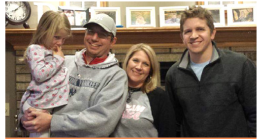
A FAVORITE PICTURE OF MY STEP-DAUGHTER