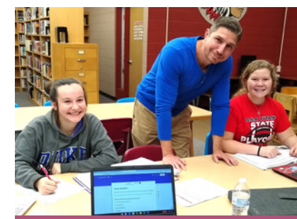
I LOVE MY JOB!