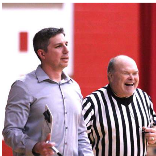
COACHING HIGH SCHOOL BASKETBALL