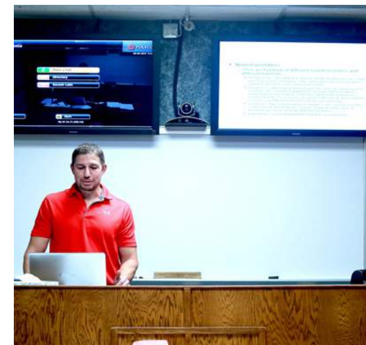
TEACHING COLLEGE PSYCHOLOGY