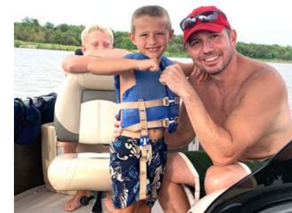
ENJOYING BOATING WITH FRIENDS AND THEIR CHILDREN