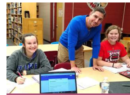
I LOVE MY JOB!