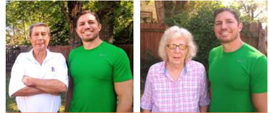
ME WITH MY PARENTS