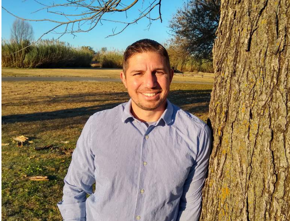
ENJOYING OUTSIDE IN SMALL TOWN AMERICA

My recent past has reinforced my deep desire to have a family. In 2013, I began dating a woman with three children, the youngest of which was two. Early on, I began to consider these children as my own, and in 2017, we got married. Unfortunately, as sometimes happens, the marriage did not work and we divorced in early 2019. As many other step-parents have discovered, after the divorce, I lost all legal rights to see the kids that I had loved and helped raise for 5 years. While my heart broke with the realization I would never be able to shoot baskets with my step-son again, or dance with my step-daughter at another "Daddy-Daughter Dance," my hope is my heart will be full once again if I am fortunate enough to adopt your child.