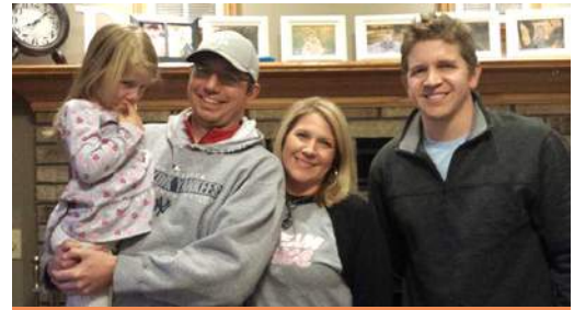
A FAVORITE PICTURE OF MY STEP-DAUGHTER