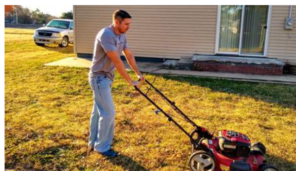
YARD WORK BUILDS CHARACTER!