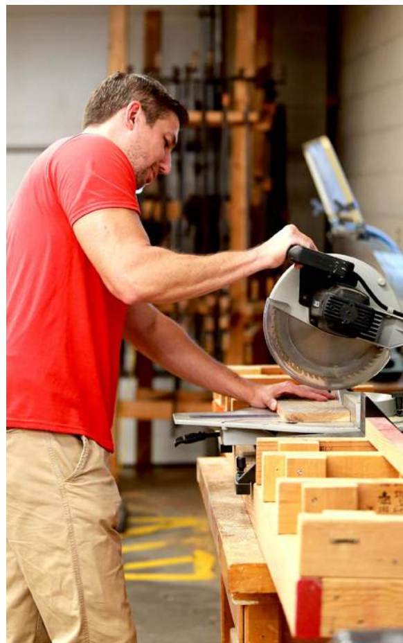
WORDWORKING HAS BECOME A NEW HOBBY

➤ In an effort to be more in touch with my Mexican heritage, I am also learning Spanish. My Dad speaks fluent Spanish and I would love to be able to not only speak with him, but pass on a second language to my child.