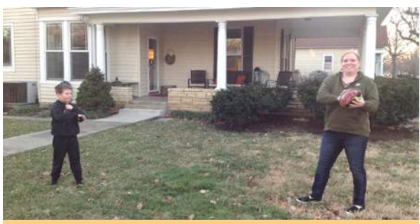
PLAYING FOOTBALL WITH MY NEPHEW