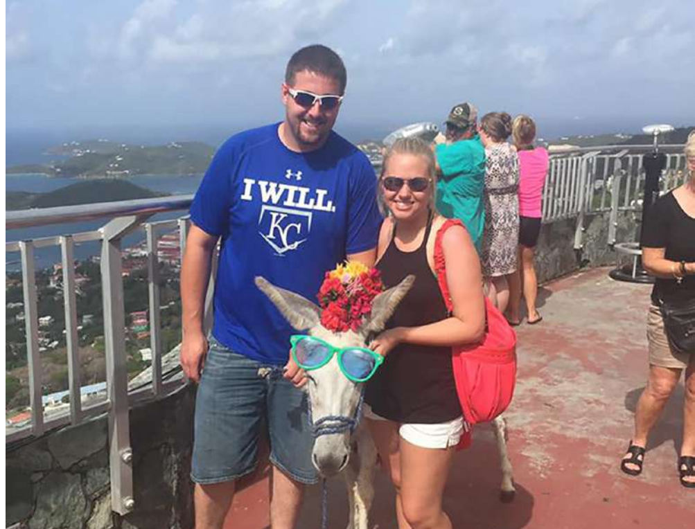
HAVING FUN ON OUR HONEYMOON ON ST. THOMAS ISLAND

WE LOOK FORWARD TO GROWING OUR FAMILY THROUGH ADOPTION AND CAN'T WAIT FOR THAT DAY TO COME!