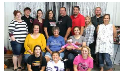
REUNION WITH BRADY'S EXTENDED FAMILY