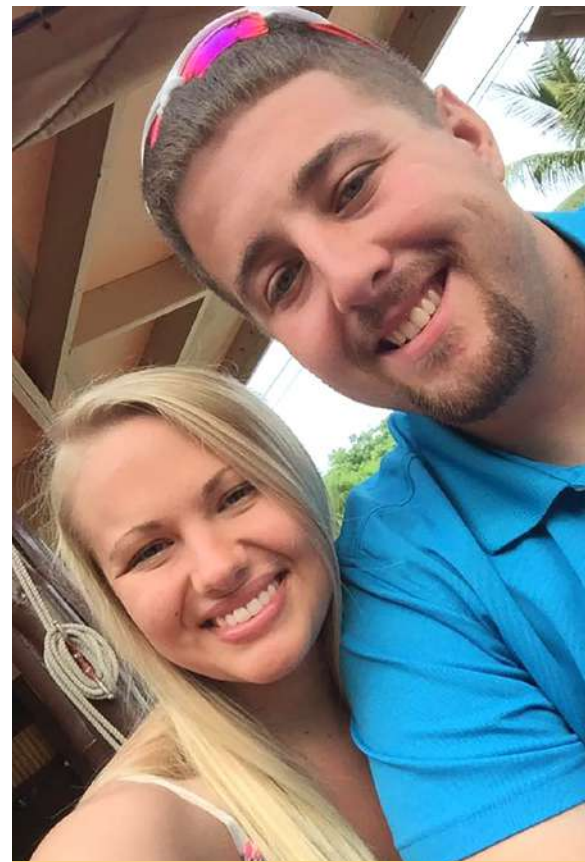
A NICE DINNER BY THE OCEAN