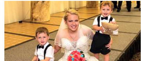
CARA'S GODSONS AT OUR WEDDING