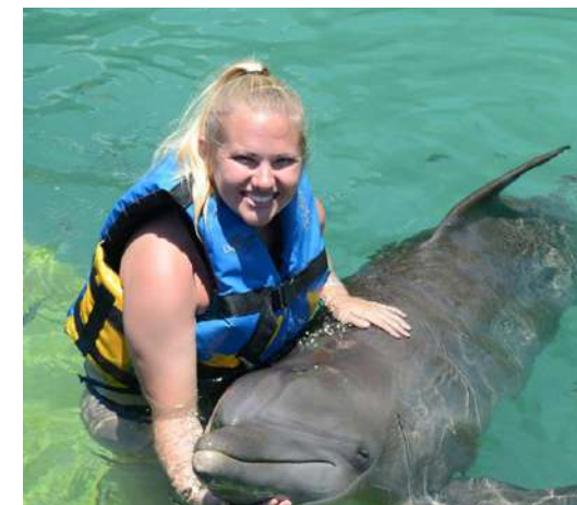
SWIMMING WITH DOLPHINS DURING OUR VACATION TO JAMAICA