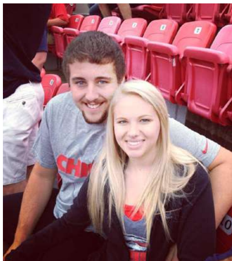
CHEERING ON THE KANSAS CITY CHIEFS!