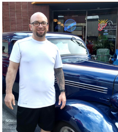
COOL GUY WITH A COOL CLASSIC CAR!