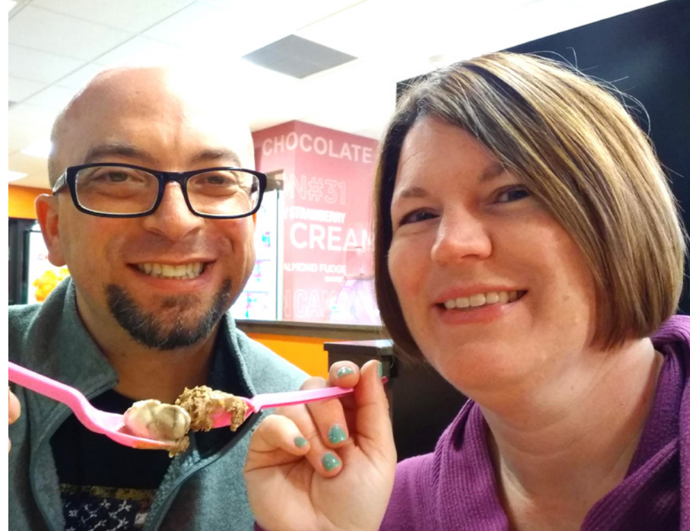
CHEERS TO OUR 2ND ANNIVERSARY!

Lindy is a sweet Boxer/terrier mix dog that we rescued from a local shelter. She is originally from St. Thomas in the Virgin Islands. Lindy does well with children and adults, is very snuggly, and knows some commands. She listens well-most of the time!