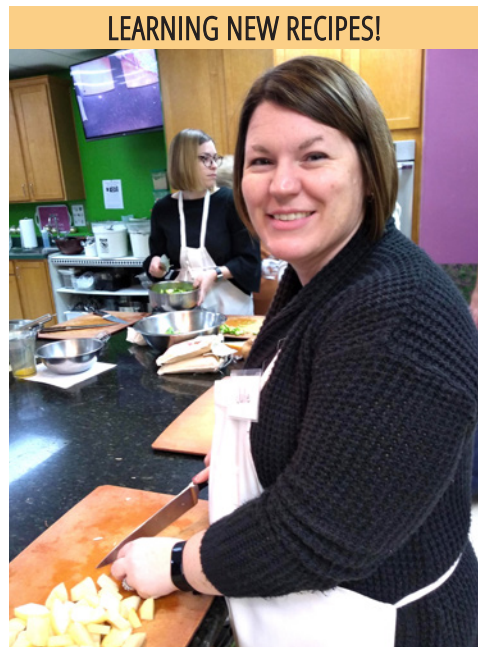
LEARNING NEW RECIPES!