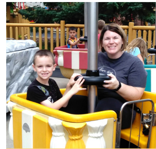
A FIRST BALLOON RIDE WITH OUR NEPHEW