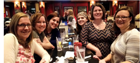
LADIES' NIGHT OUT!