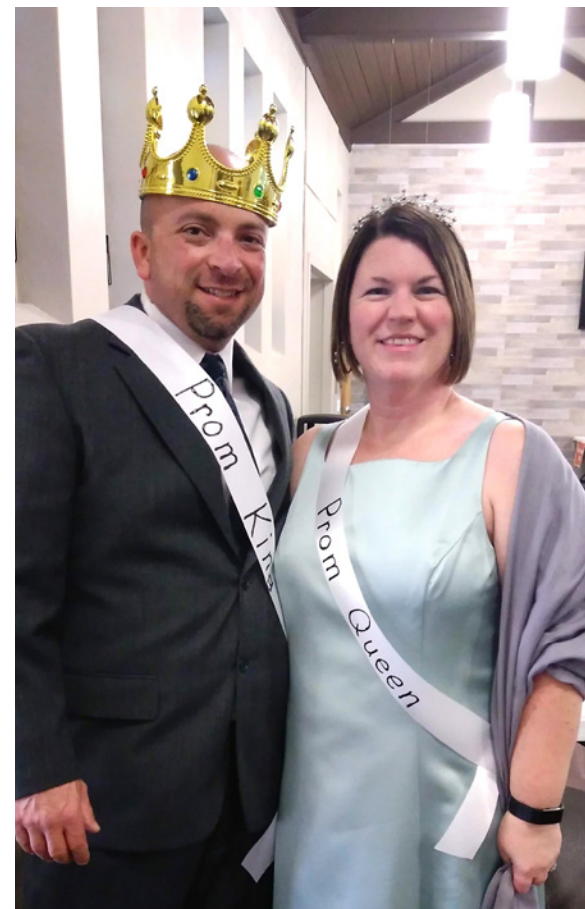
WE WERE PROM KING AND QUEEN AT TRUNK OR TREAT AT OUR CHURCH