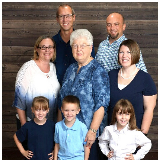
GRANDMA'S FAMILY PHOTO FOR HER BIRTHDAY

IN DECEMBER , we visit a tree farm and cut down a live tree, decorate it together, attend Christmas church service, and exchange gifts.