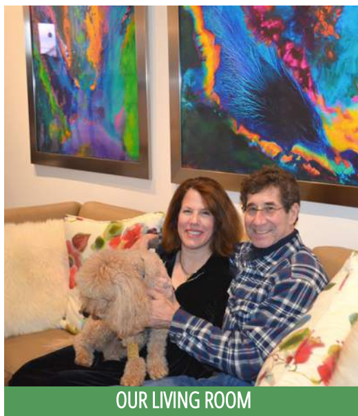
OUR LIVING ROOM

We would provide your child with an abundance of love, attention, compassion, education, and life skills. We look forward to sharing a daily routine of fun, cuddling, sharing dinner together every night, reading and singing before bedtime, playing, and learning.