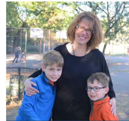
FUN AT THE PLAYGROUND