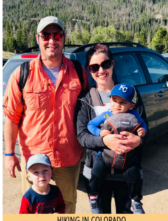
HIKING IN COLORADO