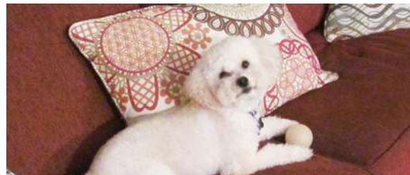
OUR PUP TEDDY