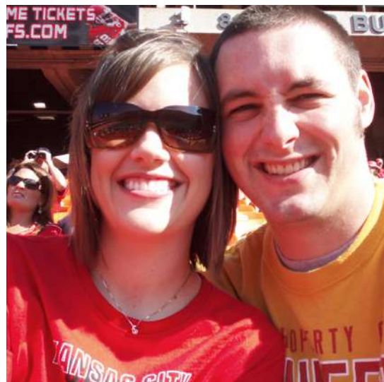
CHEERING ON THE CHIEFS