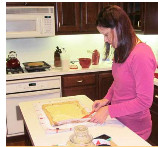
BAKING FOR THANKSGIVING