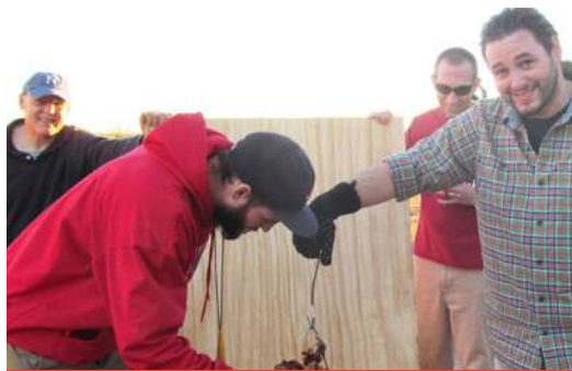
FRYING A TURKEY FOR THANKSGIVING