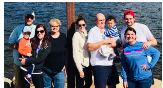
TY'S FAMILY VACATIONING IN COLORADO