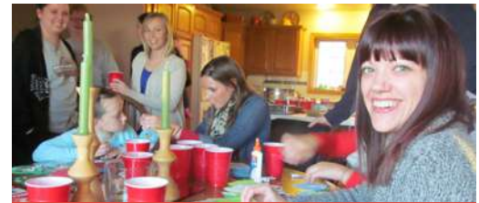
MAKING CRAFTS WITH COUSINS