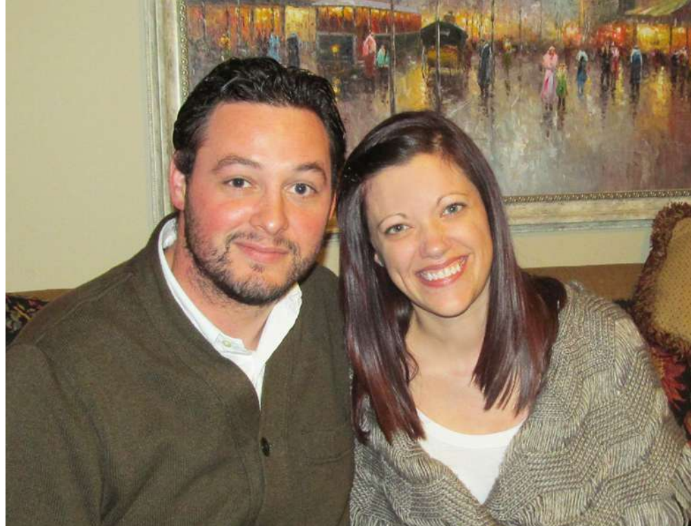
OUR HEARTS AND ARMS ARE READY TO WELCOME ANOTHER CHILD INTO OUR FAMILY