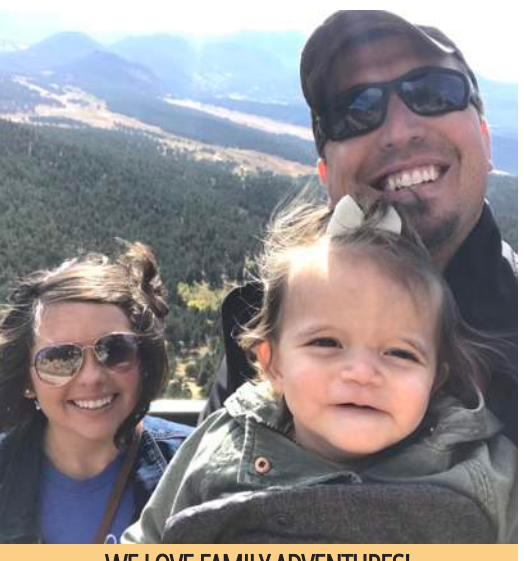
WE LOVE FAMILY ADVENTURES!