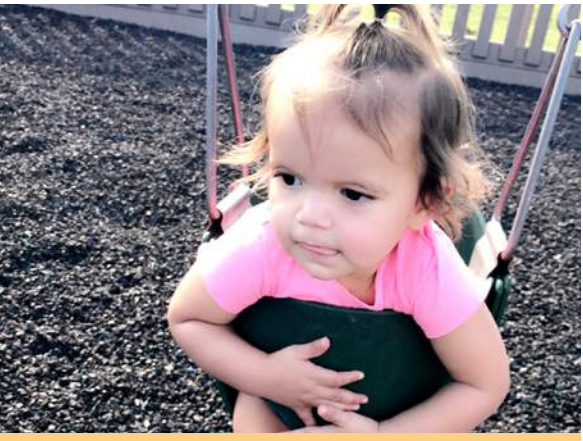
A GREAT DAY AT THE PARK