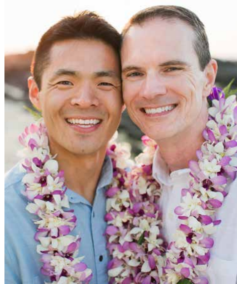
ALOHA FROM HAWAII