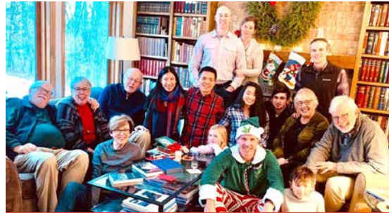
THE MOST WONDERFUL TIME OF YEAR WITH FAMILY