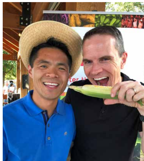
BEING "CORNY" AT THE FARMER'S MARKET