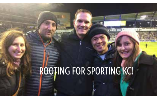
ROOTING FOR SPORTING KC!