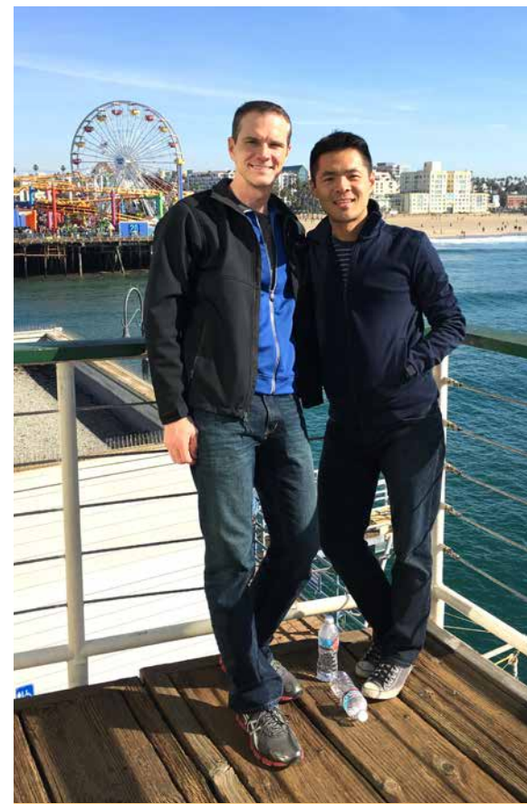
WE LOVE TRAVELING TO NEW PLACES

We look forward to creating new memories with our future little one.