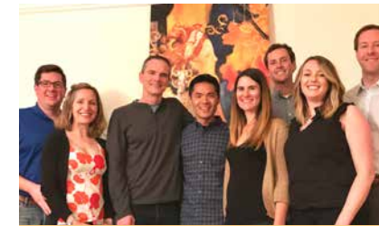
DINNER DATES WITH FRIENDS