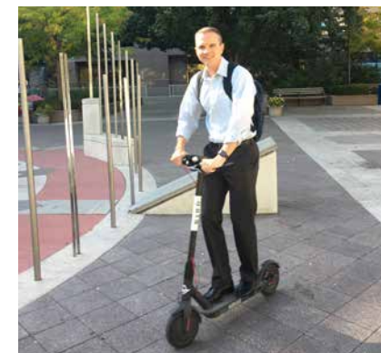
SCOOTIN' TO A WORK CONFERENCE