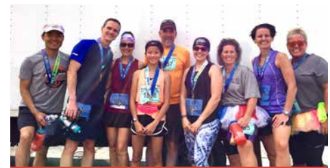
ANOTHER RUN WITH FAMILY & FRIENDS