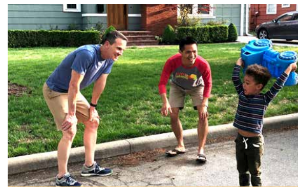
OUR NEIGHBOR LOVES TO STOP BY AND PLAY