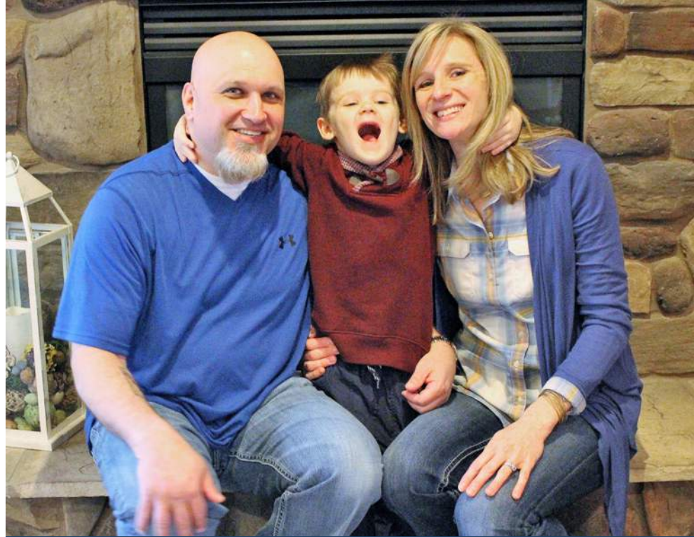
WE CAN'T WAIT TO BE A FAMILY OF FOUR