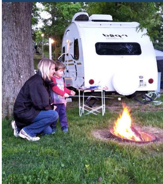
ROASTING MARSHMALLOWS FOR THE FIRST TIME