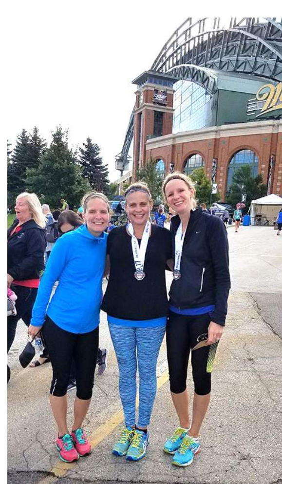
FRIENDS AND RUNNING PARTNERS FOR 10 YEARS