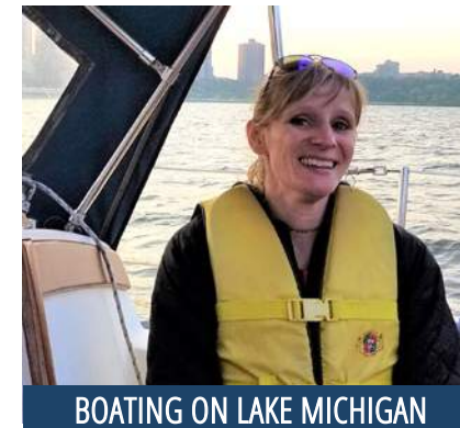
BOATING ON LAKE MICHIGAN