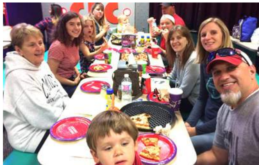
FAMILY PIZZA PARTY