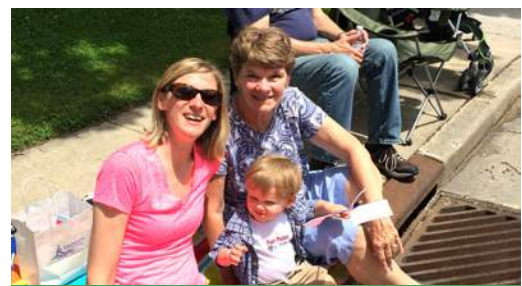
4TH OF JULY PARADE... A FAVORITE!