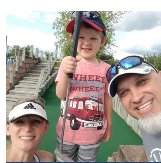
FAMILY FUN AT MINIATURE GOLF