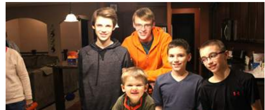
FUN TIMES WITH THE COUSINS