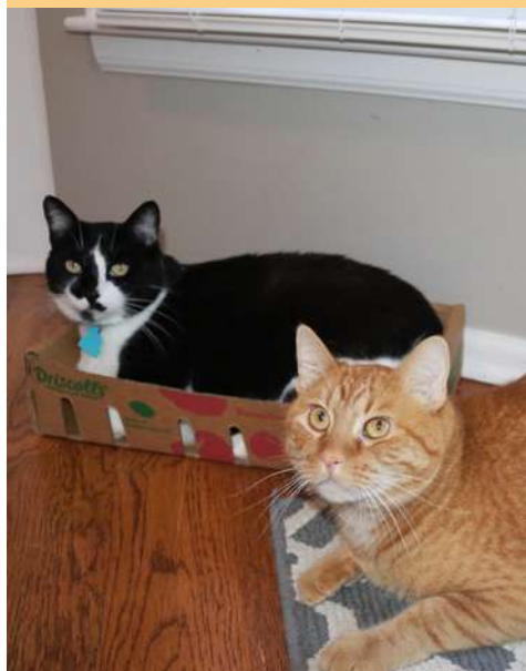
MEET SCOUT AND STELLA!