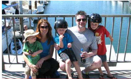
VISITING FAMILY IN CALIFORNIA