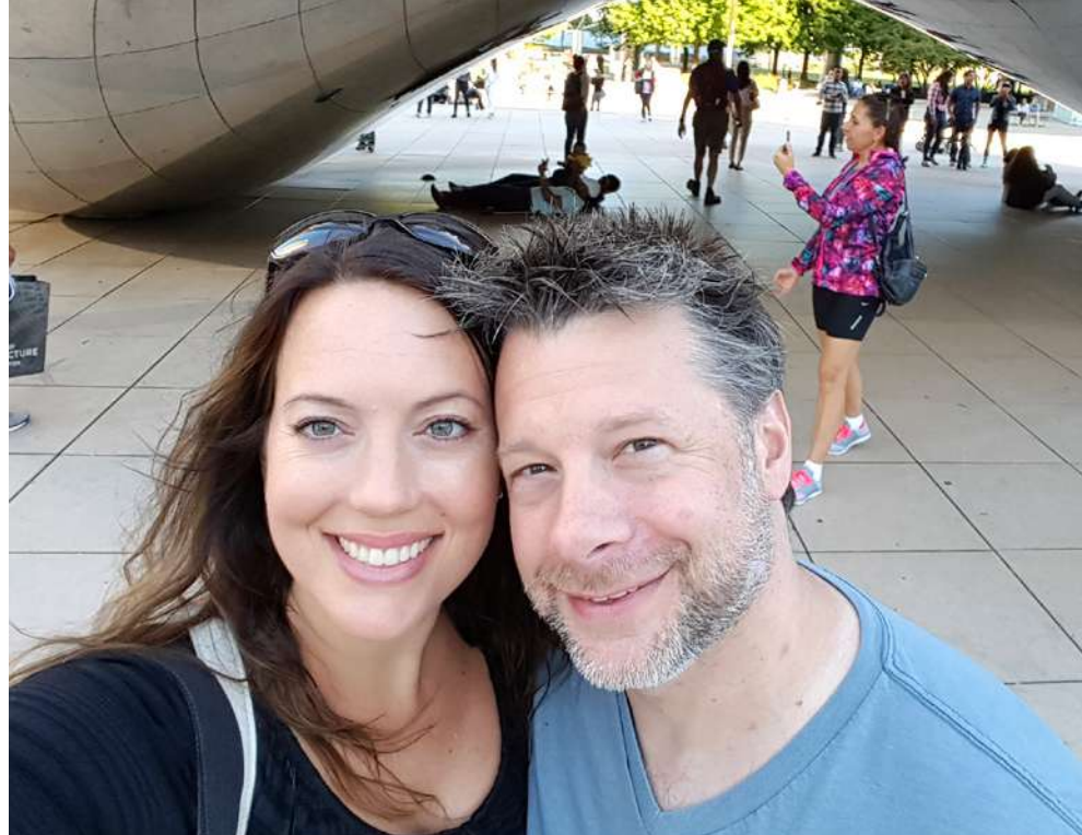
ON OUR HONEYMOON IN CHICAGO

SHAWN: (1) thrillers, (2) watching sports, (3) butter pecan ice cream