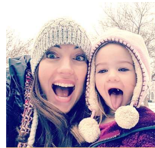
PLAYING IN THE SNOW