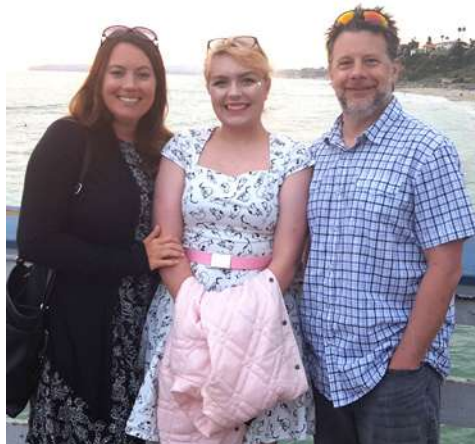
FAMILY VACATION IN SAN DIEGO