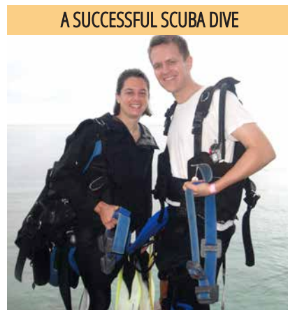
A SUCCESSFUL SCUBA DIVE