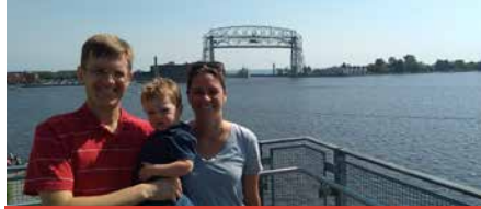
FAMILY TRIP TO DULUTH