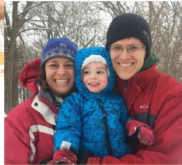
ENJOYING THE WINTER WONDERLAND