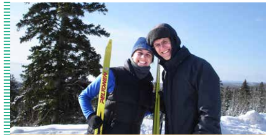
WE LOVE SKIING ADVENTURES