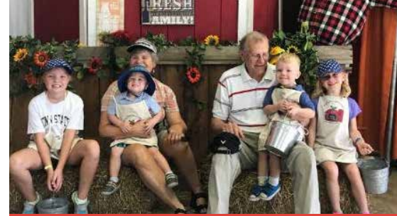
GRANDPA & GRANDMA WITH GRANDKIDS