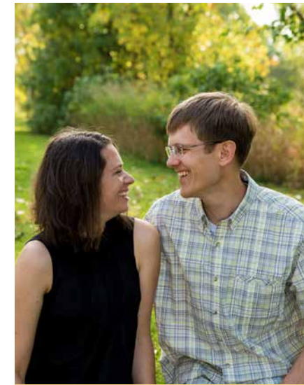
WE'RE BEST FRIENDS!