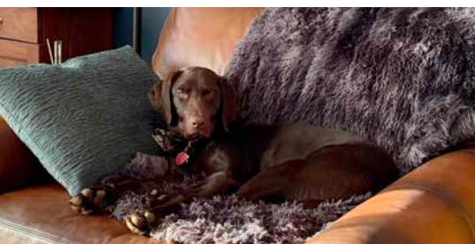
POPS...POPSICLE...JALAPENO POPPER. THESE ARE SOME OF THE NAMES OUR SWEET POPPY ENDURES