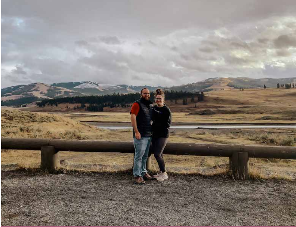
2020 TRIP TO THE GORGEOUS YELLOWSTONE NATIONAL PARK