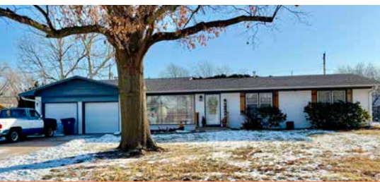
OUR HOME IN THE WINTER

O ur home is in a quiet neighborhood in Wichita, Kansas. One thing we especially love about Wichita is that it feels like a small town, but with large town amenities. We live in a charming older home that we've enjoyed personalizing and making it our own. We have a fenced in backyard and large trees that make our home feel secluded and perfect to enjoy a cup of coffee outside. Over the years we've planted many veggies and herbs that freshen up our meals during the summer. We added an above ground pool to the backyard, and that has been a great way for us to unwind together, away from our phones! Our dream is to one day add a pizza oven to the backyard. We live 10 minutes from Emily's parents, 5 minutes from Emily's sister, and 2 hours from John's family.