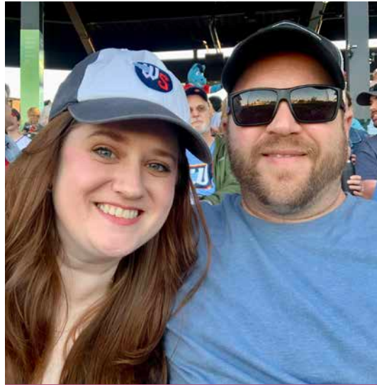
BASEBALL IS OUR FAVORITE SPORT!