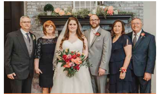
WITH OUR PARENTS