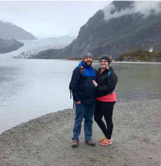
MENDENHALL GLACIER IN JUNEAU