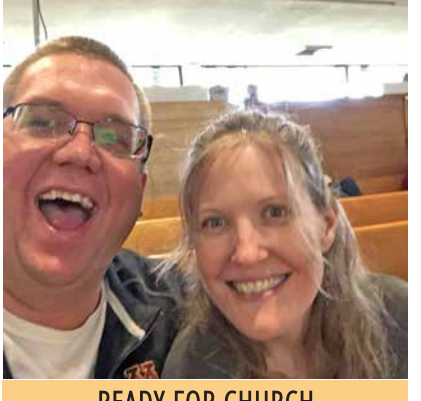
READY FOR CHURCH