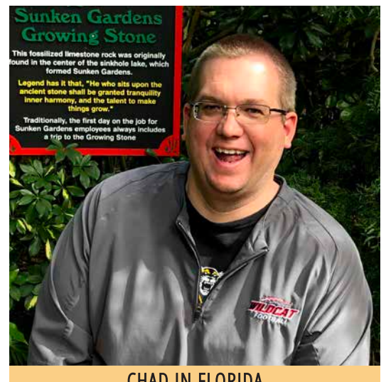
CHAD IN FLORIDA