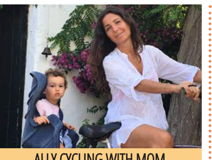
ALLY CYCLING WITH MOM