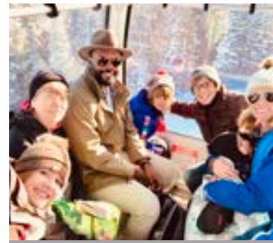
FAMILY SKI LIFT FUN!