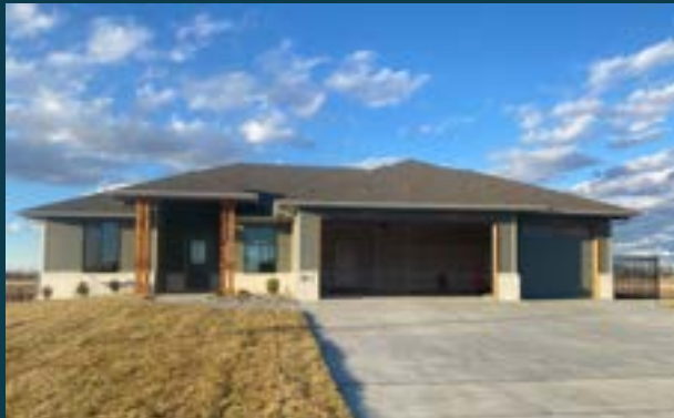
HOME SWEET HOME

We have a fantastic group of friends that are very close so all our kids have lots of "aunts and uncles" that aren't blood relatives.