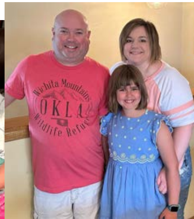
EASTER WEEKEND AT JENNIFER'S PARENTS FARM