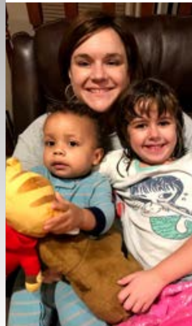
WE LOVE OUR COUSIN