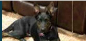
OUR PUP DAISY