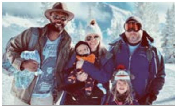
SKI TRIP WITH STEVE'S SISTER AND FAMILY