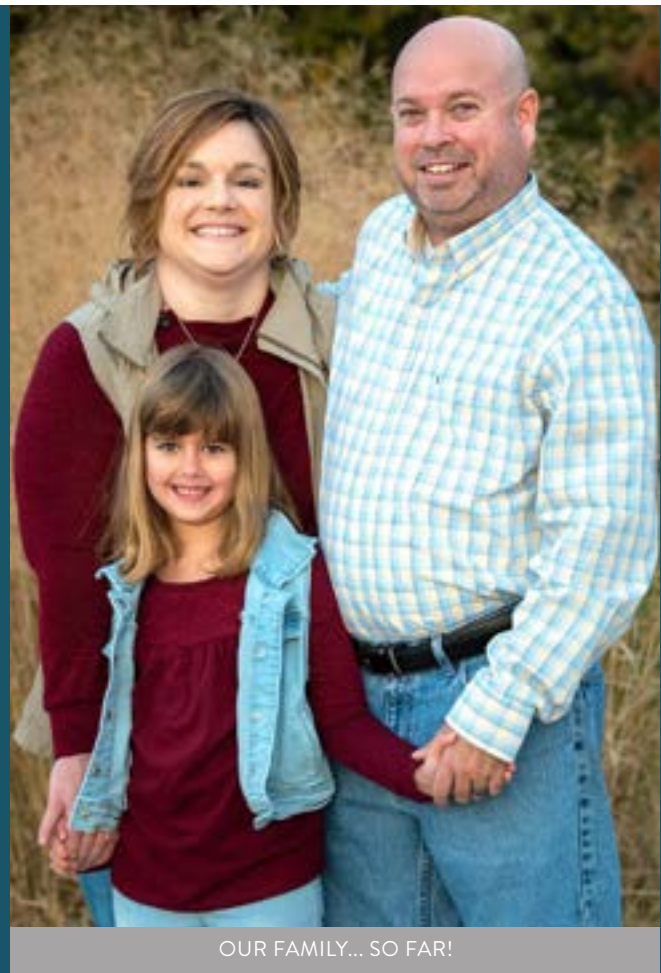
OUR FAMILY... SO FAR!