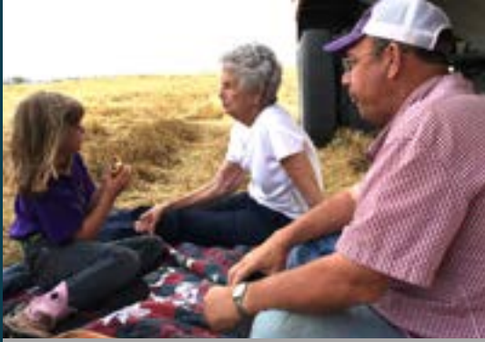
HARVEST PICNIC WITH GRANDMA & GRANDPA