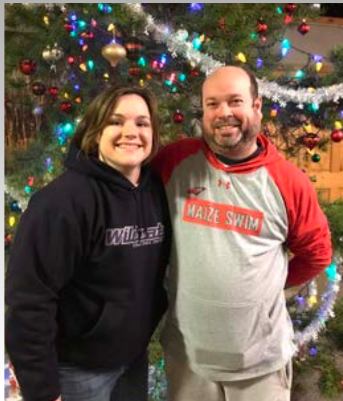
CELEBRATING THE HOLIDAYS