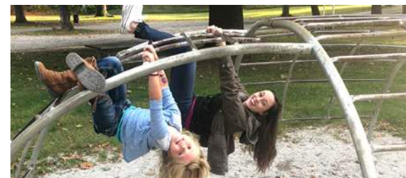
WE LOVE TAKING OUR NIECE TO THE PARK TO PLAY