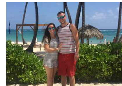
FUN IN THE SUN