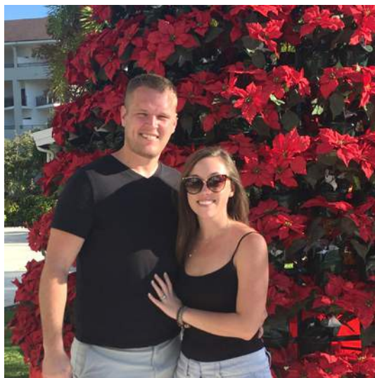
CHRISTMAS TIME IN JAMAICA 2017