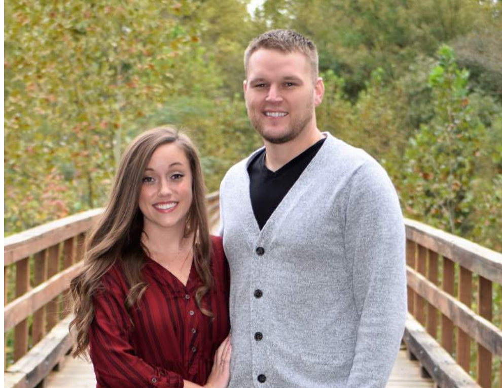
WE ARE SO EXCITED TO START A FAMILY