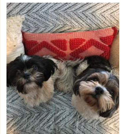
GRANT AND GUS

They are spirited, playful, and excellent with children.