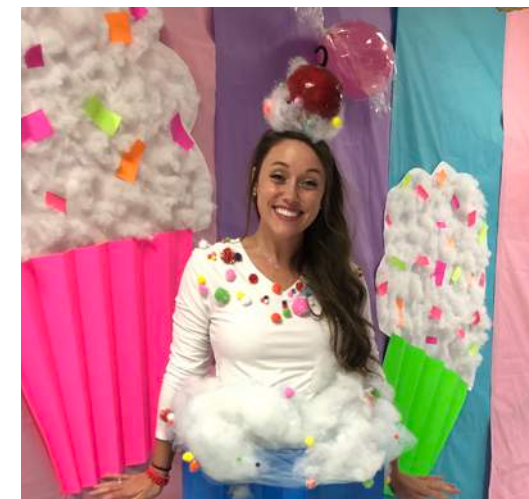
DRESSED UP TO SURPRISE KINDERGARTEN!