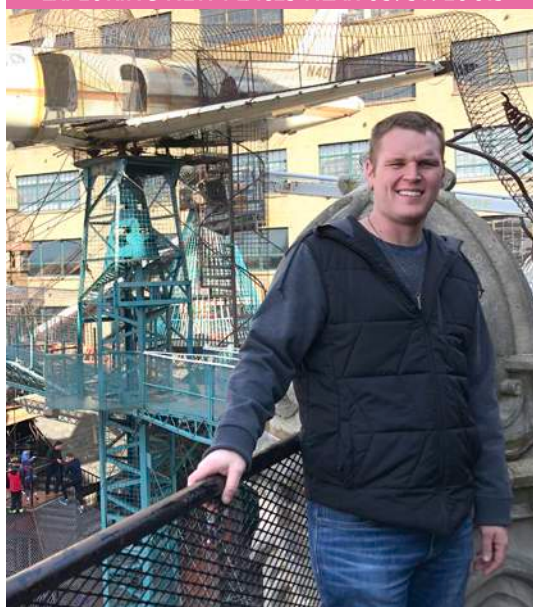
EXPLORING NEW PLACES NEAR US. ST. LOUIS