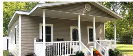
HOME SWEET HOME