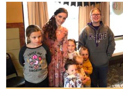
LITTLE COUSINS AT A WEDDING SHOWER