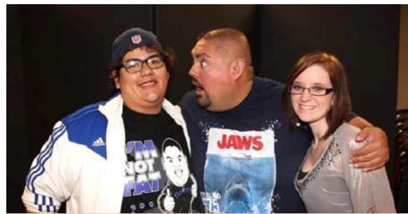
GOT TO MEET THE GREAT FLUFFY