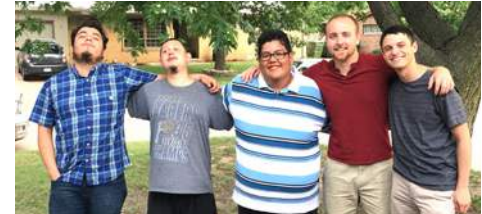
WEDDING BBQ WITH THE BROS