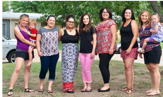
WEDDING BBQ WITH MY GIRLS & RING BEARER