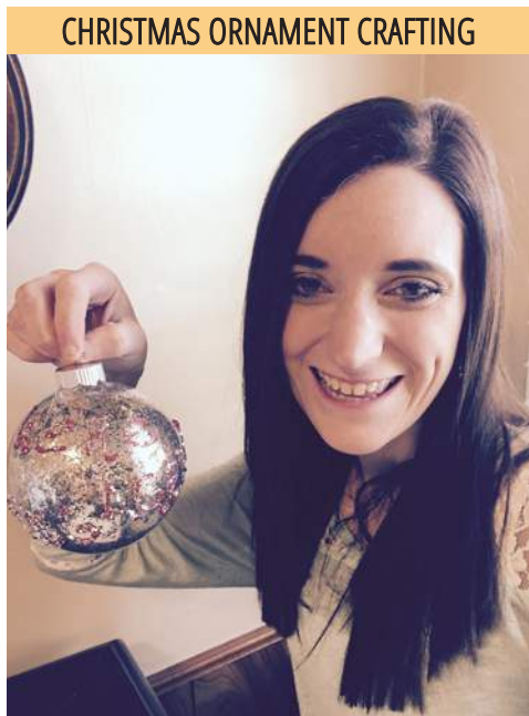
CHRISTMAS ORNAMENT CRAFTING