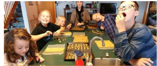
ANNUAL PEPPERNUIT EXTRAVAGANZA