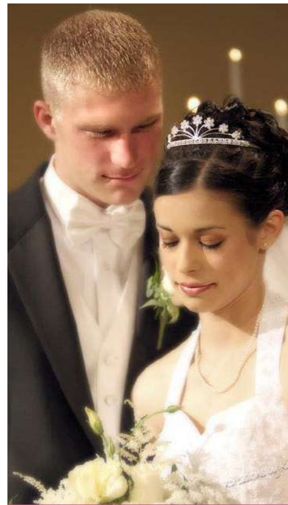
OUR VERY SPECIAL DAY