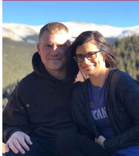
ENJOYING THE MOUNTAINS OF COLORADO