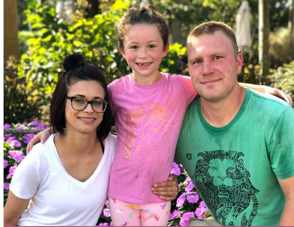
OUR FAMILY... SO FAR!