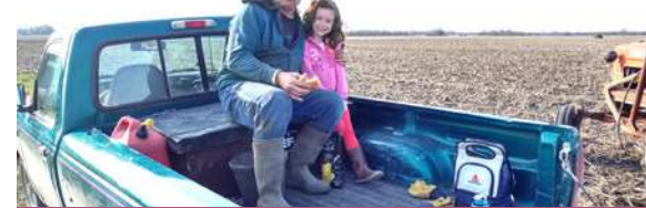
SUPPER IN THE FIELD WITH PAPA JOHN