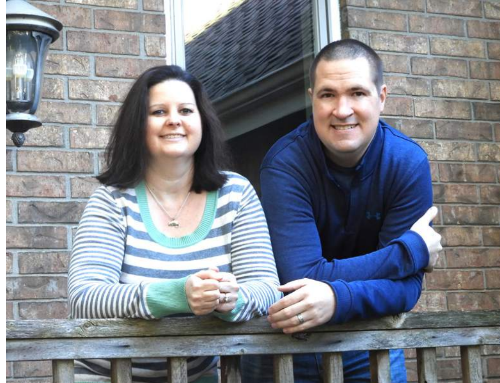
WE'RE SO READY TO WELCOME A CHILD INTO OUR HEARTS AND HOME