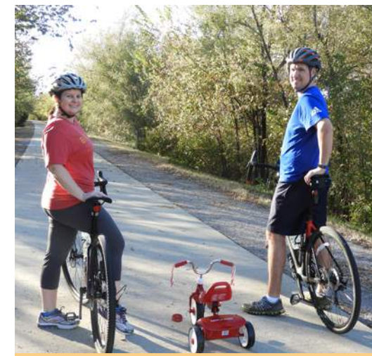
WAITING FOR OUR THIRD WHEEL