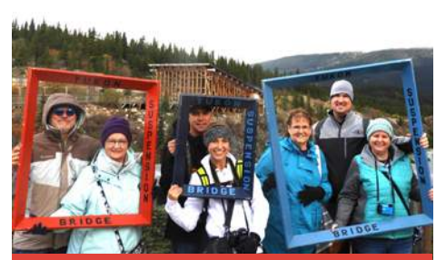
VISITING CANADA WITH OUR FAMILIES