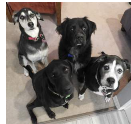
MEET OUR PUPS!