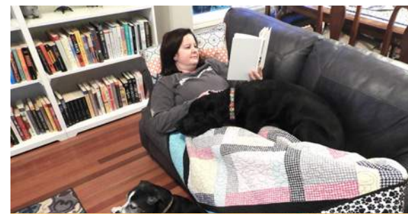
SNUGGLING WITH THE DOGS WHILE I READ