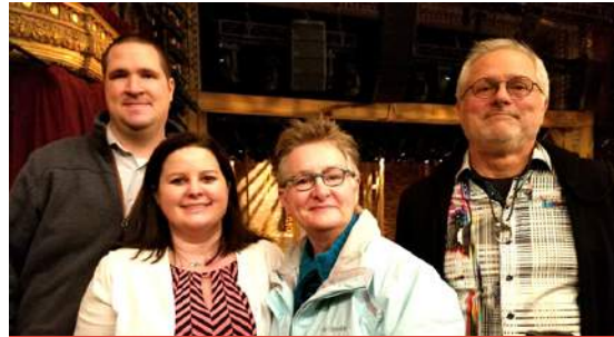
SEEING HAMILTON WITH KENDRA'S PARENTS