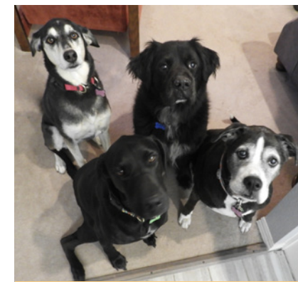
MEET OUR PUPS!