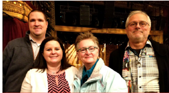
SEEING HAMILTON WITH KENDRA'S PARENTS