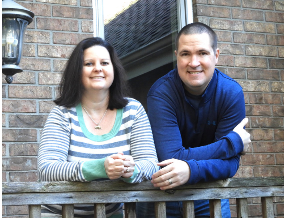
WE'RE SO READY TO WELCOME A CHILD INTO OUR HEARTS AND HOME