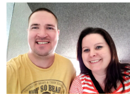
HANGIN' AT THE TOP OF THE ARCH