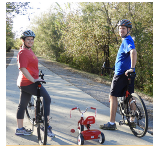
WAITING FOR OUR THIRD WHEEL