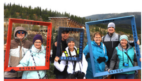
VISITING CANADA WITH OUR FAMILIES