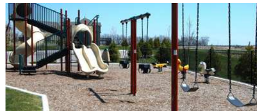
WE HAVE A BIG PARK DOWN THE STREET