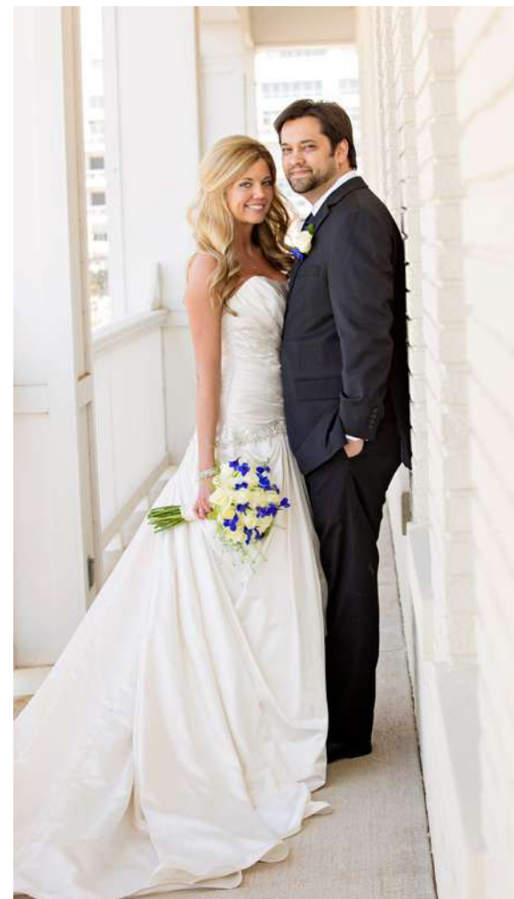
OUR VERY SPECIAL DAY