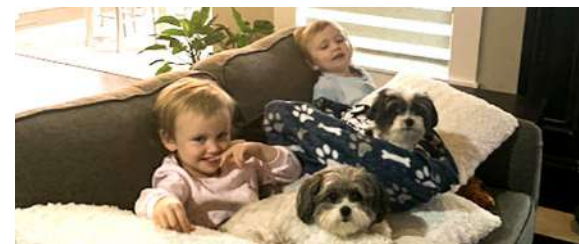
BANDIT AND ROSIE LOVE NIECE CUDDLES