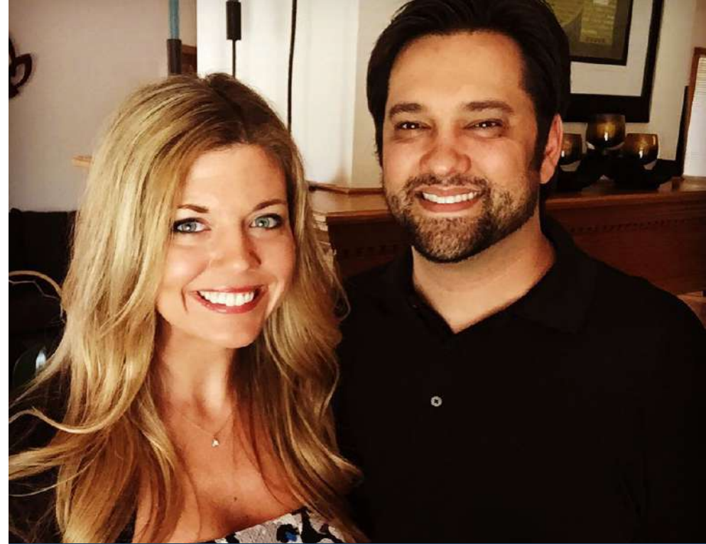
WE ARE MORE THAN READY AND EXCITED TO WELCOME A CHILD INTO OUR FAMILY