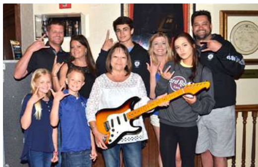
ROCKIN' WITH TJ'S FAMILY