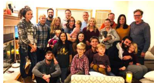
LEA'S BIG FAMILY HAS LOTS OF PLAYMATES!