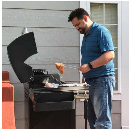
GRILLING FOR THE FAMILY DINNER