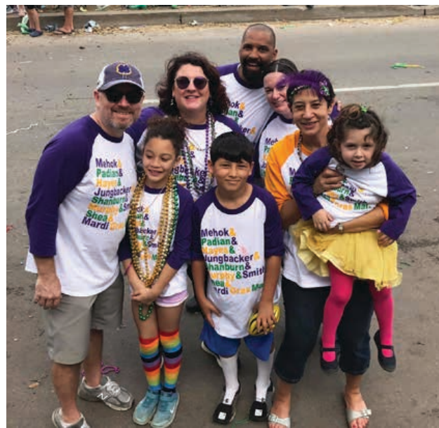
WITH FRIENDS AT "THE SPOT" FOR MARDI GRAS

New Orleans is a family-friendly town where there is always something new to do. Every weekend, you can find a parade to watch, a festival to attend, jazz to listen to, or a crawfish boil to enjoy. And, the whole city stops and fires up barbeque grills for Saints football games.