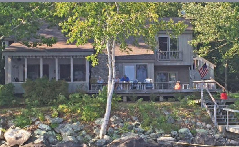
VIEW OF THE HOUSE FROM THE LAKE