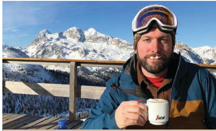
UNCLE TIM WITH A HOT CHOCOLATE MUSTACHE