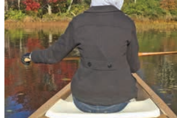
FALL IN MAINE

My brother lives in a small town in Washington State. In his free time, he enjoys taking hikes that allow him to see more of the beauty of the Northwest and skiing. He is excited to show his first niece or nephew his corner of the country!