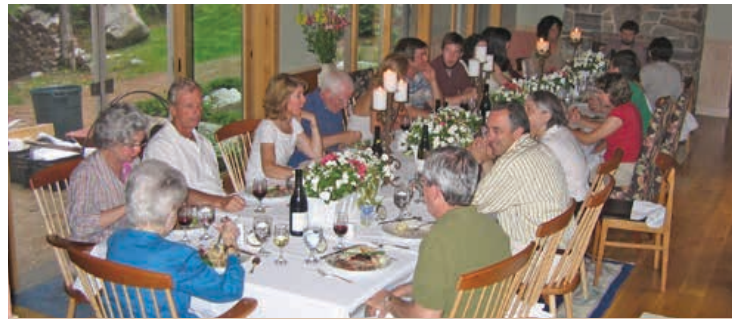
BIG FAMILY DINNER