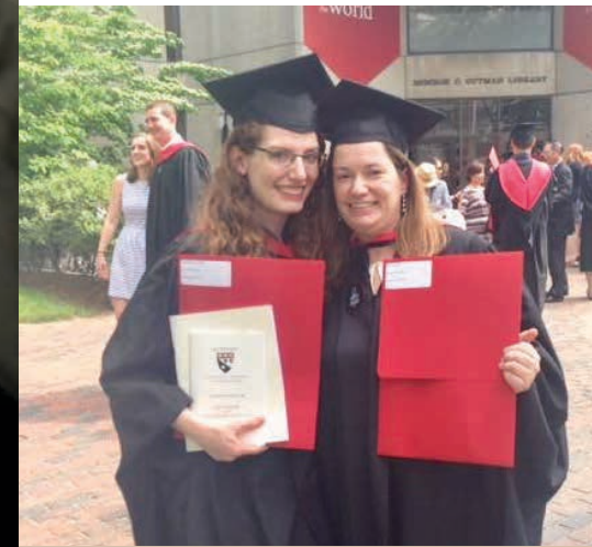
GRADUATION DAY AT HARVARD

➔ MY FAMILY: While I only have one brother, my thirteen cousins have always been more like siblings to me. We spend holidays together, and we spend time each summer at a house my grandparents built in Maine.