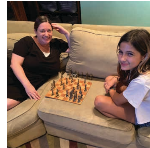
PLAYING CHESS WITH MY FRIEND'S DAUGHTER