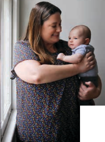
HANGING OUT WITH MY FRIEND'S SON

Growing up, my mother, father, brother and I always joined my cousins, aunts, and uncles there for at least two weeks each summer. My cousins and I spent hours making up games and playing pretend on "the rock," which is just a large rock that provides a place to stand a few yards into the lake. We also went tubing, waterskiing, kayaking, and canoeing every day.