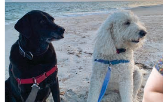
AT THE BEACH!