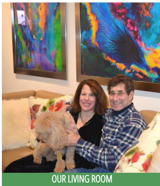
OUR LIVING ROOM

We would provide your child with an abundance of love, attention, compassion, education, and life skills. We look forward to sharing a daily routine of fun, cuddling, sharing dinner together every night, reading and singing before bedtime, playing, and learning.