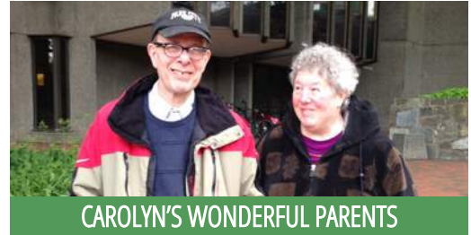
CAROLYN'S WONDERFUL PARENTS