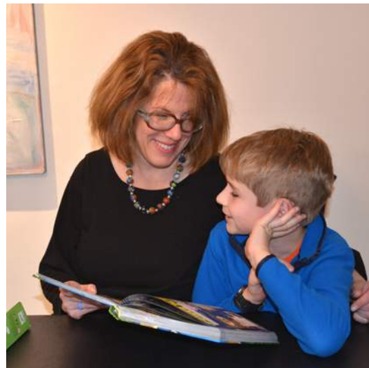
WE LOVE TO READ!