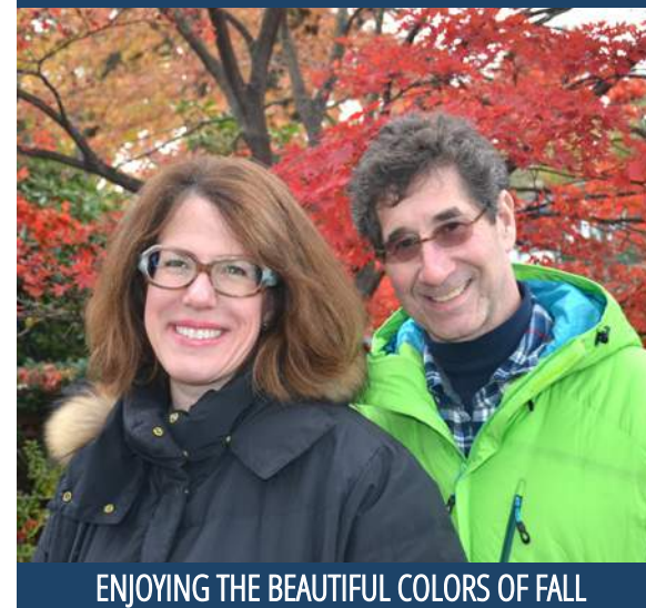
ENJOYING THE BEAUTIFUL COLORS OF FALL

Time passes easily for both of us when we are together traveling, working on our real estate projects, visiting with Carolyn's parents, or having a quiet day just playing with our dog, Curly. Mostly, we just like spending time together.