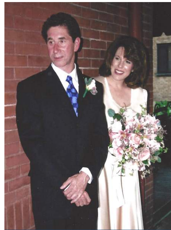
OUR SPECIAL DAY