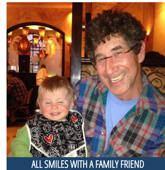
ALL SMILES WITH A FAMILY FRIEND