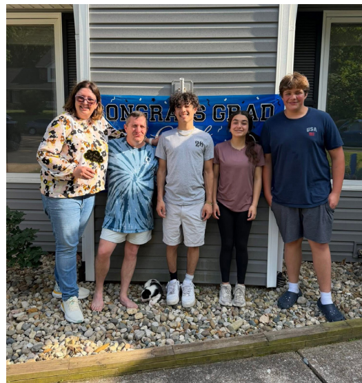
OUTSIDE OF OUR HOME