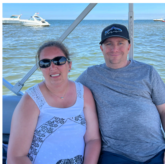
BOATING IN MICHIGAN