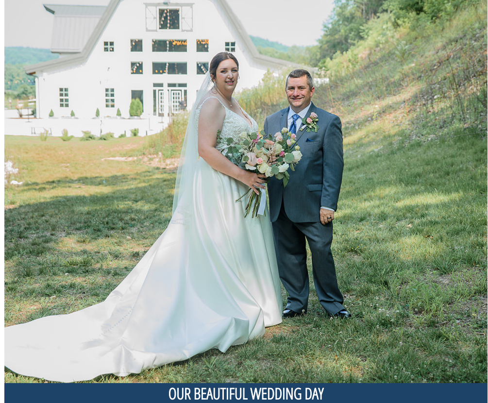
OUR BEAUTIFUL WEDDING DAY

We hope to share a Christian faith with our child. It is important to us to have dinner as a family and to pray before meals and before bedtime. We would like to send our future child to Catholic school to help grow their education and spirituality.