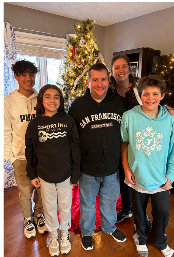
FAMILY TOGETHER AT CHRISTMAS IN OUR HOME

We love going on family vacations and learning about new cultures. We also enjoy watching football, baseball, hockey, and soccer either in person or on television. We can't wait to teach our future child to play various sports or let them explore their individual interests. Another thing we really enjoy is reading, and we can't wait for story time with another little one, both at home and at the local library. In our spare time, we like going for walks or hikes and fishing. Taking trips to a nearby river to fish is one of our favorite weekend getaways.