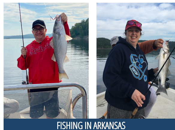
FISHING IN ARKANSAS