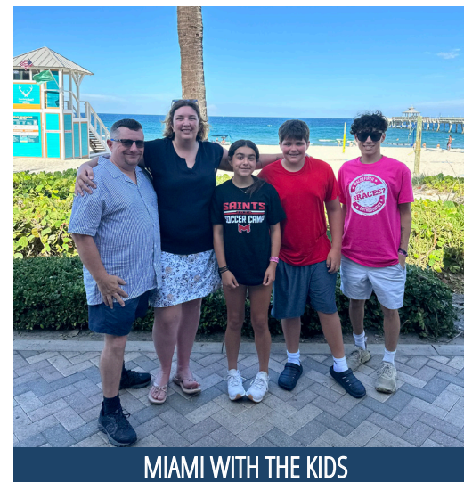
MIAMI WITH THE KIDS