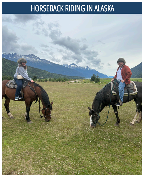
HORSEBACK RIDING IN ALASKA