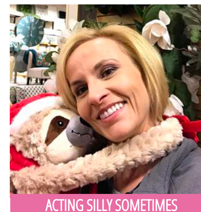
ACTING SILLY SOMETIMES