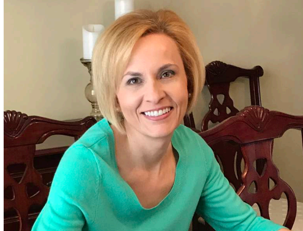
READY TO WELCOME A CHILD INTO MY HEART AND HOME

I love Sci Fi. I grew up watching Star Wars and Star Trek . I also love to eat Chocolate Chip cookie dough.