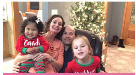
MY BROTHER AND HIS FAMILY