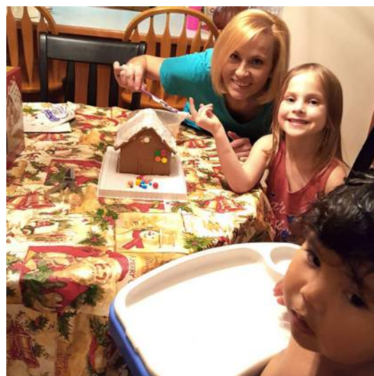
HOLIDAY FUN WITH MY NIECES