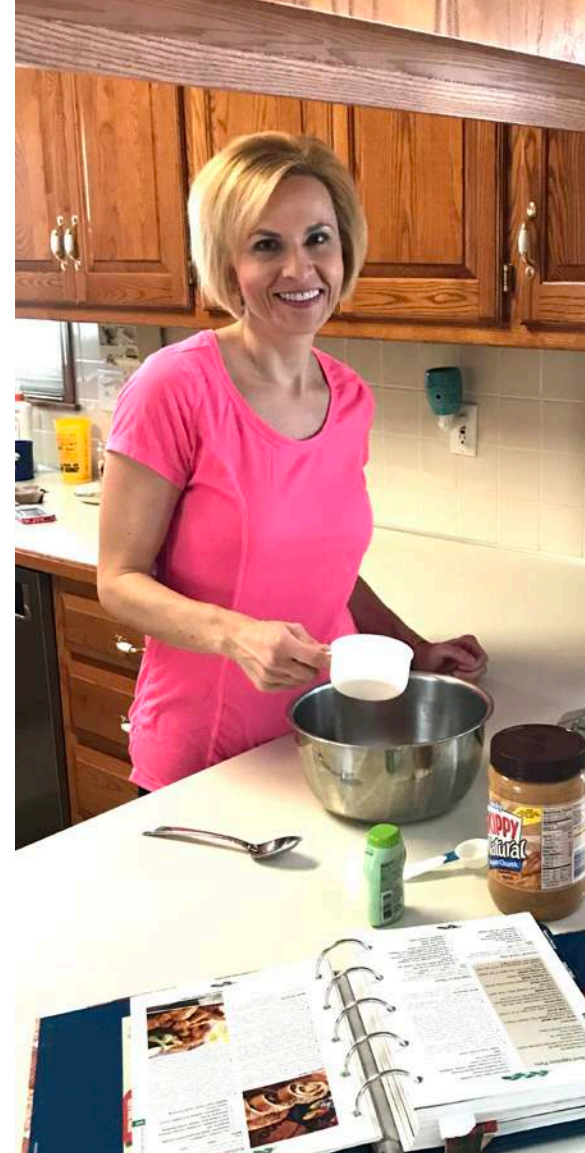
BAKING... A FAVORITE HOBBY!