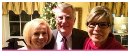
WITH DAD AND FAMILY

Teach the value of having fun, exploring new places and cultures