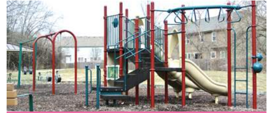
AN AWESOME PLAY GROUND NEARBY