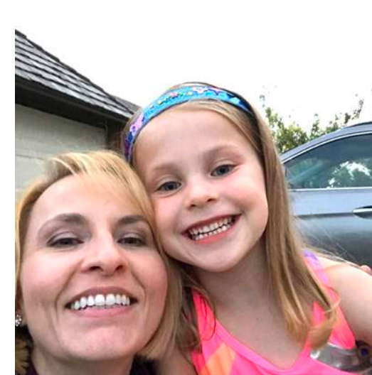
LOTS OF SMILES WITH MY NIECE