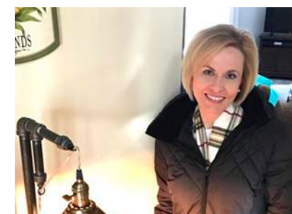
OUT TO THE WALKING TRAIL