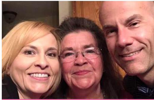
MY MOM, BROTHER AND ME