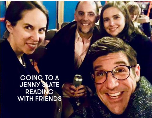
GOING TO A JENNY SLATE READING WITH FRIENDS