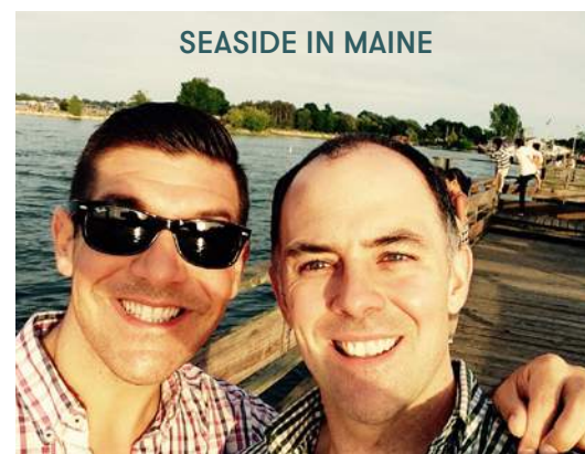
SEASIDE IN MAINE