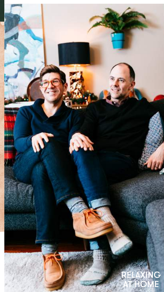
RELAXING AT HOME