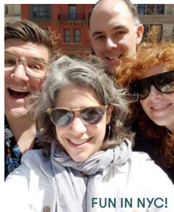
FUN IN NYC!