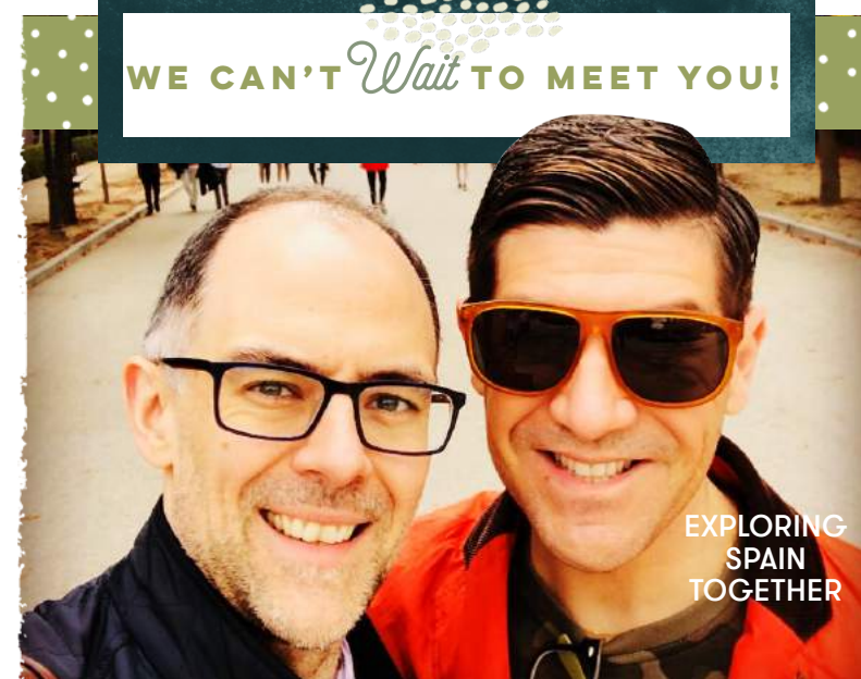
EXPLORING SPAIN TOGETHER