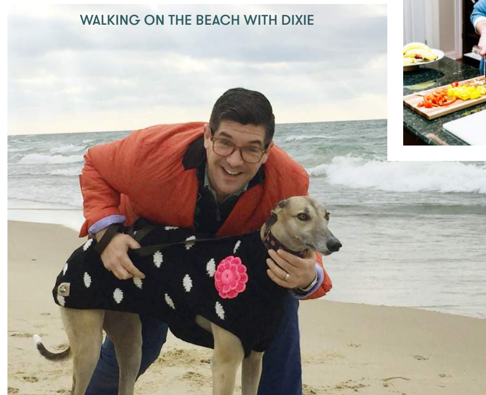
WALKING ON THE BEACH WITH DIXIE