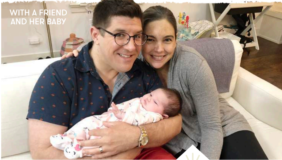
WITH A FRIEND AND HER BABY