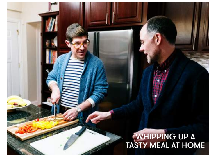
WHIPPING UP A TASTY MEAL AT HOME