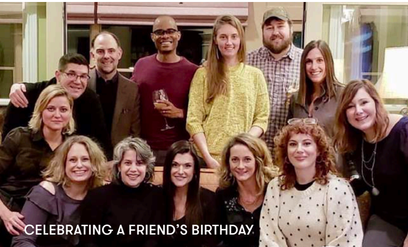
CELEBRATING A FRIEND'S BIRTHDAY