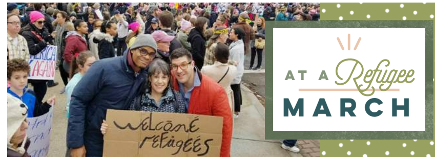
AT A Refugee MARCH