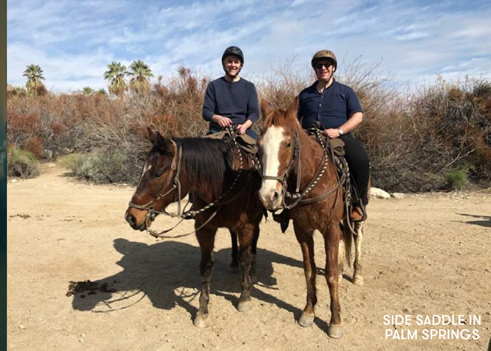
SIDE SADDLE IN PALM SPRINGS