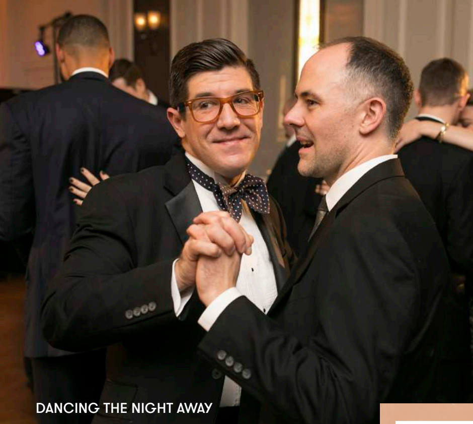
DANCING THE NIGHT AWAY