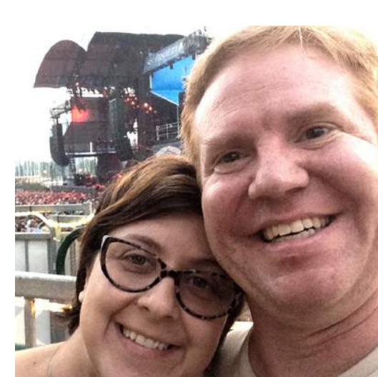
SUMMER CONCERT ON CHICAGO'S LAKEFRONT