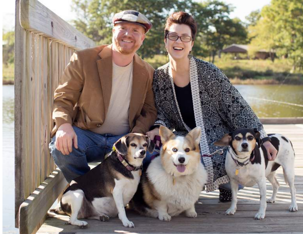
WE CAN'T WAIT TO WELCOME A NEW CHILD INTO OUR FAMILY

FUN FACT ➤ Our favorite room in the house is the living room... where family time happens!