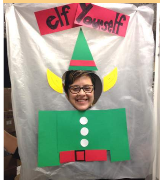
WE LOVE CELEBRATING HOLIDAYS