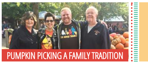
PUMPKIN PICKING A FAMILY TRADITION

W e are committed to sharing with our child their adoption story, their life story. We are looking forward to sharing with them all we get to know about you. We are committed to finding a level of openness that feels right to both of us.