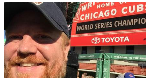
CHEERING ON THE HOME TEAM