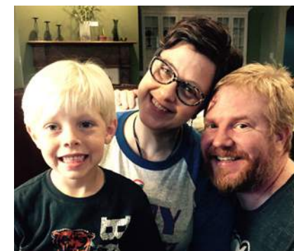
VISITING OUR NEPHEWS IN FLORIDA