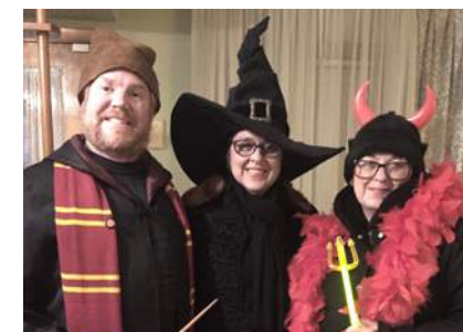
COSTUME PARTY WITH FRIENDS