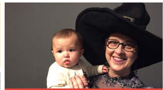
TRICK OR TREATING WITH FAMILY