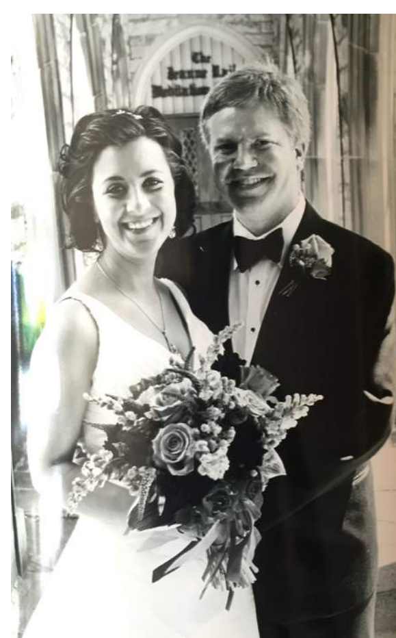
NOW & FOREVER