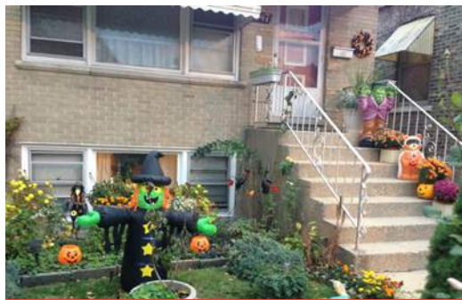
DECKED OUT FOR HALLOWEEN!