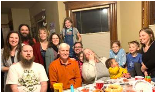
FAMILY BIRTHDAY GATHERINGS ARE A BLAST