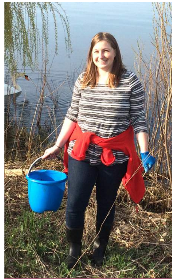
MY DAD & I TAKE PART IN THE ANNUAL LAKESHORE CLEANUP

We love the outdoors! We enjoy spending time at playgrounds, exploring new places, hiking, and visiting the cider mill in the fall for caramel apples.