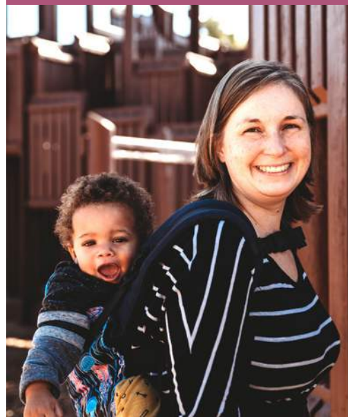
OUR FAVORITE WAY TO TRAVEL... BABY WEARING!