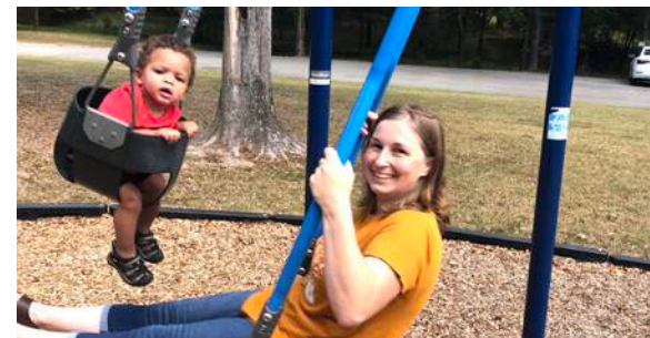
WE BOTH ENJOY SWINGING