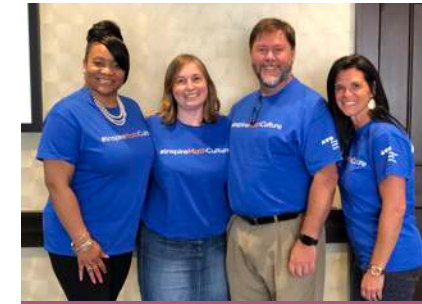
MAKING MATH BETTER FOR STUDENTS