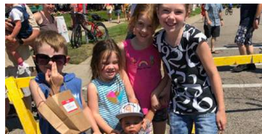
SULLY HAVING FUN WITH COUSINS