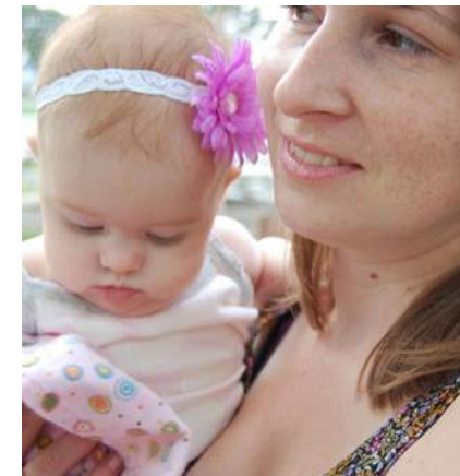
I LOVE PLAYING WITH MY NIECE