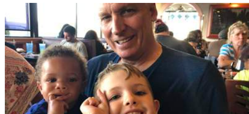
CHILLIN' WITH PAPA