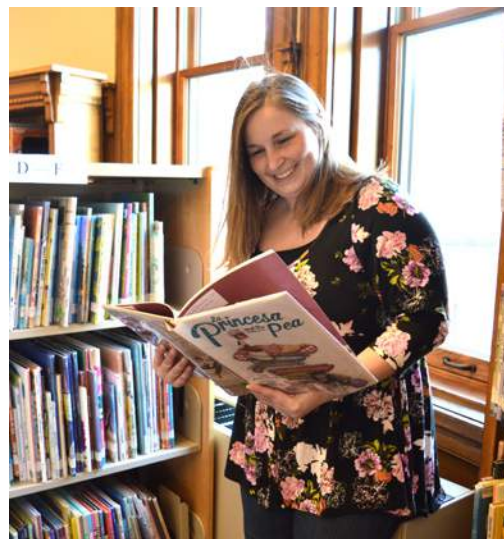
WE CAN NEVER READ ENOUGH BOOKS!