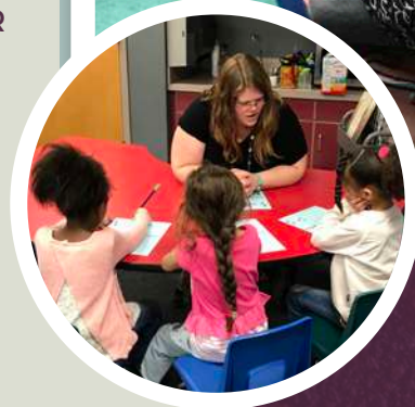
Working with a small group