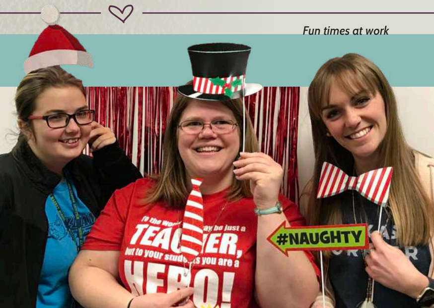
Fun times at work