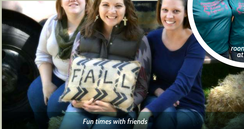
Fun times with friends