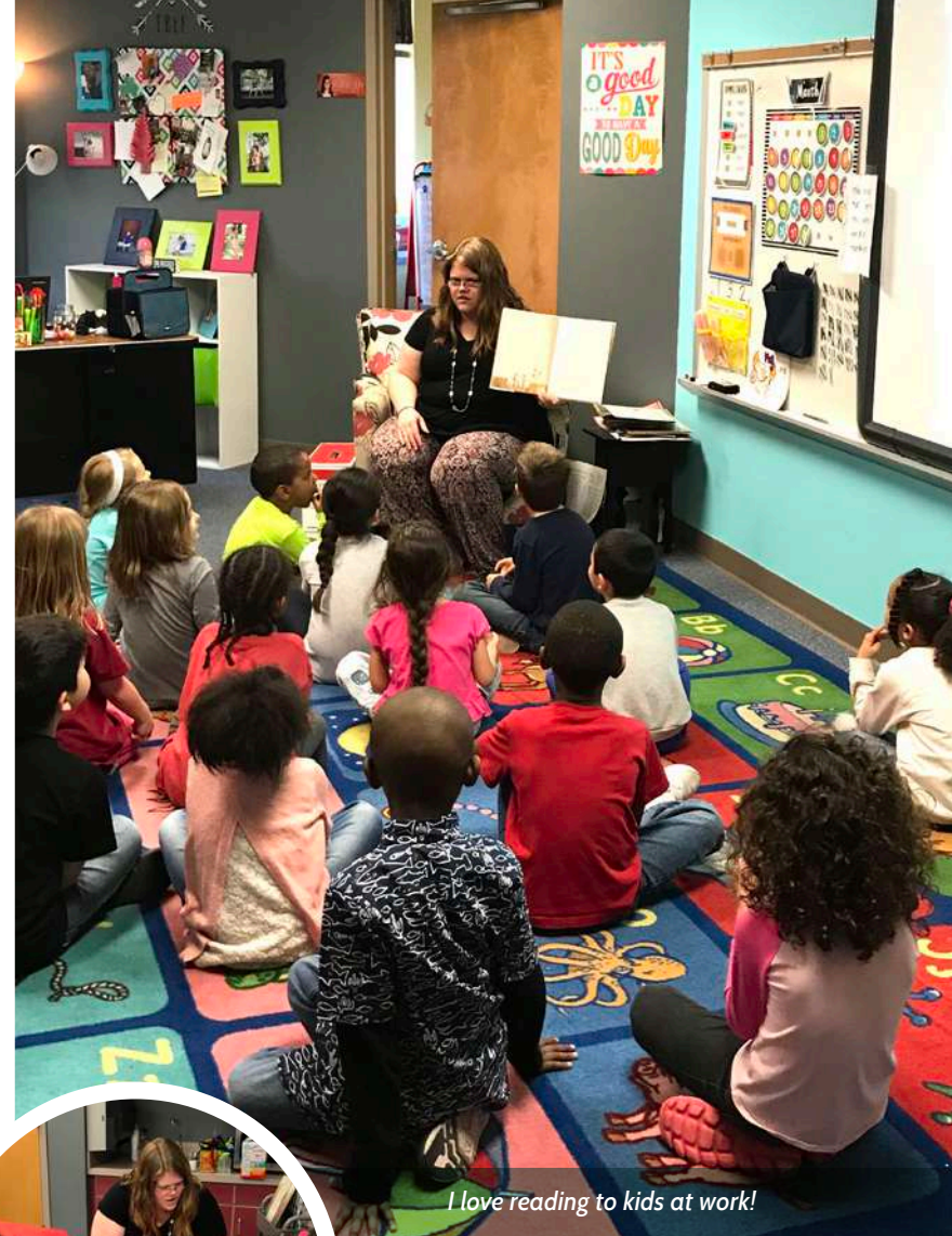
I love reading to kids at work!

➔ I ENJOY HANGING OUT WITH MY FAMILY AND FRIENDS. My family is always there for me and willing to do whatever I need. My friends are just an extension of my family. They are there for me no matter what. I can sit with my friends and talk and tell stories until we are laughing so hard that we cry.