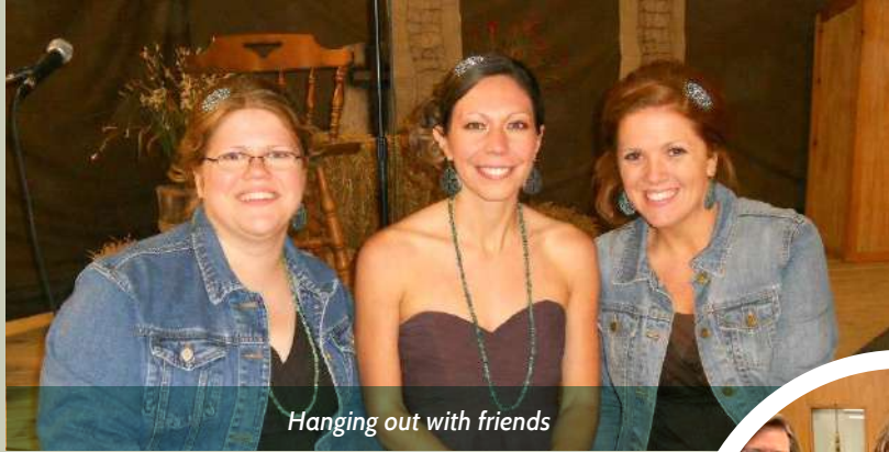
Hanging out with friends