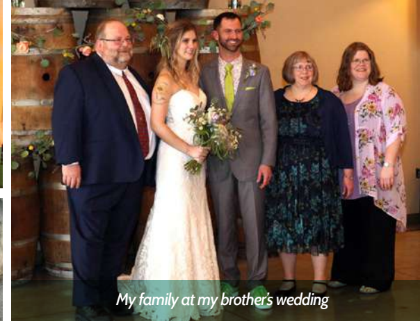
My family at my brother's wedding