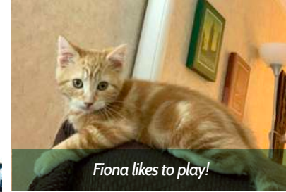
Fiona likes to play!