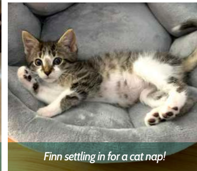
Finn settling in for a cat nap!