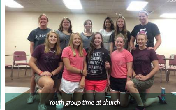
Youth group time at church