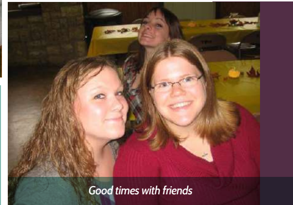
Good times with friends