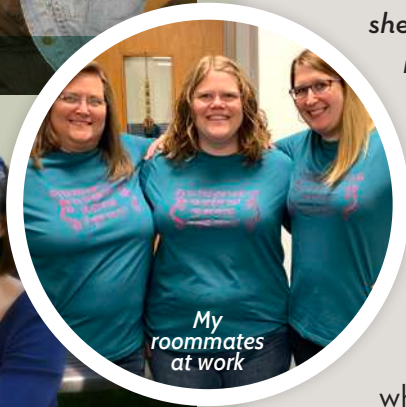
My roommates at work