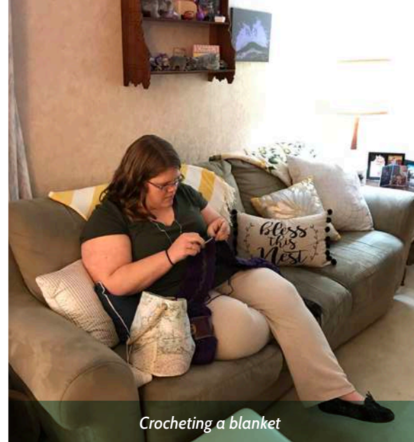
Crocheting a blanket

I have been teaching for 11 years. I have always wanted to be a teacher and love that this is what I am doing for the rest of my life. I also enjoy that I have my summers off and can spend that time with people that I love and do fun things like day trips to areas around me. The people that I work with are wonderful as well.