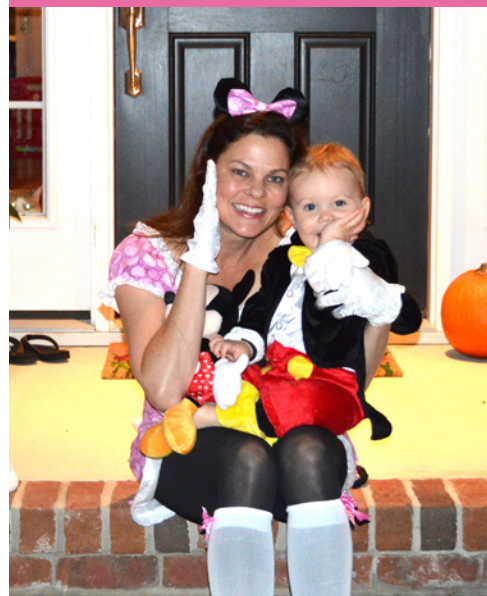
FUN ON HALLOWEEN NIGHT