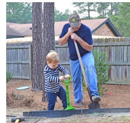
HELPING DAD WITH YARD WORK