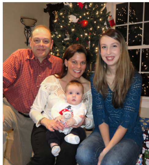
WITH BENJAMIN'S BIRTHMOTHER