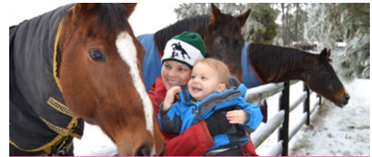
VISITING TANGO ON A SNOWY DAY