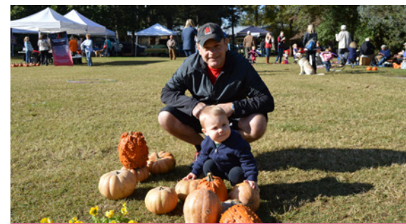
PICKING OUT PUMPKINS WITH DAD