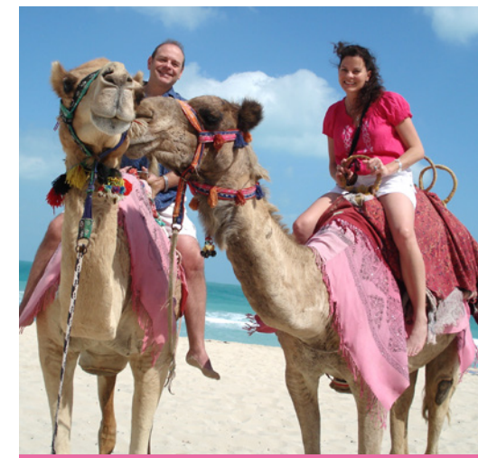
RIDING CAMELS IN DUBAI