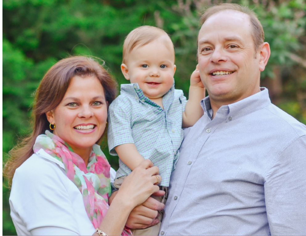
OUR LITTLE FAMILY IS READY TO WELCOME AND LOVE ANOTHER CHILD!