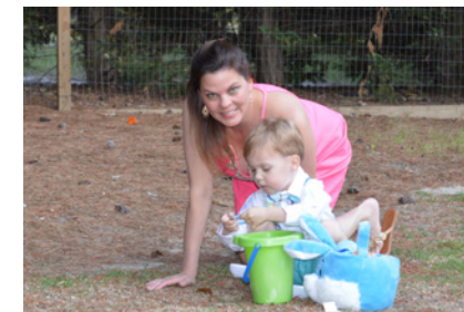
EASTER EGG HUNTING WITH MOM