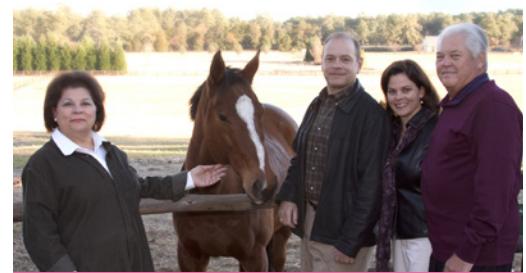
VISITING TANGO WITH FAY'S PARENTS