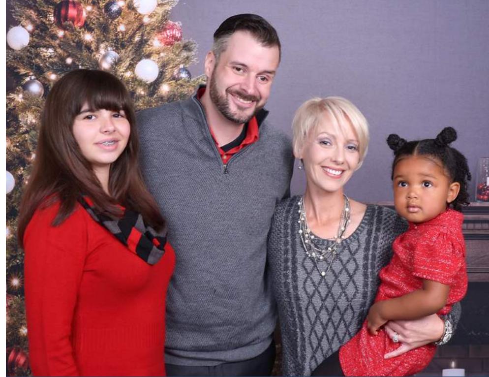
WE'RE VERY EXCITED TO WELCOME ANOTHER CHILD INTO OUR HEARTS

We wish to share our passion and zest for life with our children. We would want only to inspire and lead them to be knowledgeable and powerful individuals. We value education and hard work to succeed in life. We value supporting each other through hardships and difficult times. Our children will know the power of family and have a sense of belonging. We promise to raise a strong, caring and loving individual.