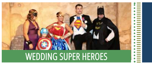
WEDDING SUPER HEROES