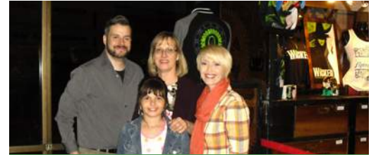
FAMILY NIGHT OUT AT THE MUSIC THEATER

Our extended family consists of grandparents, aunts, uncles and numerous cousins! Our parents live close by and can't wait to be grandparents again! We meet for dinner on Sundays and gather for all the holidays throughout the year.