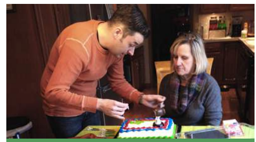
PREPARING FOR LILY'S BIRTHDAY PARTY