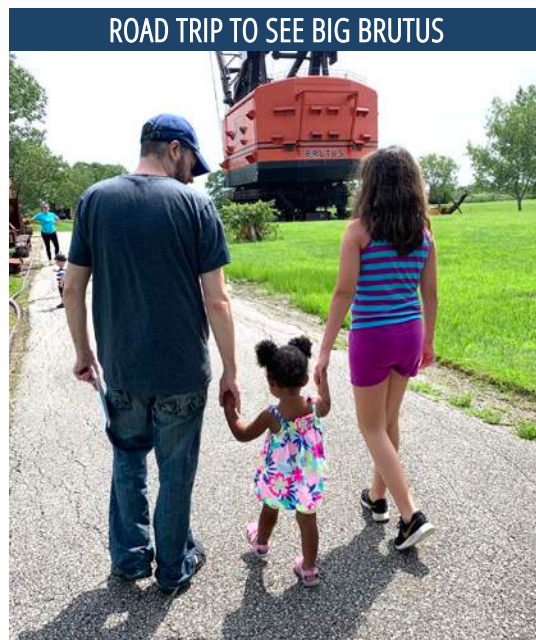
ROAD TRIP TO SEE BIG BRUTUS