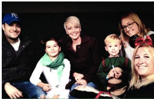
FAMILY FALL FUN!