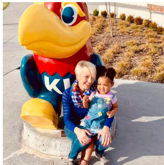
VISITING MOM'S COLLEGE CAMPUS