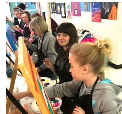
COUSINS PAINTING TOGETHER