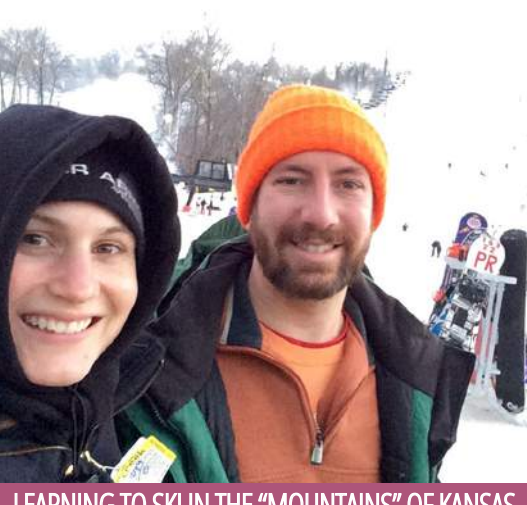
LEARNING TO SKI IN THE "MOUNTAINS" OF KANSAS