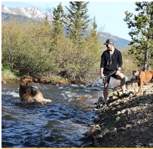
DOWN BY THE CREEK BY OUR HOUSE