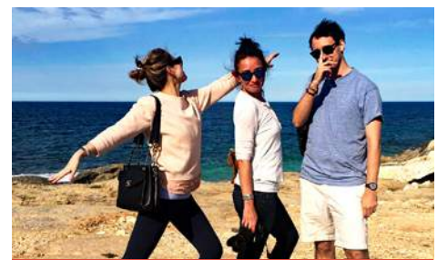
STEPH WITH HER SIBLINGS