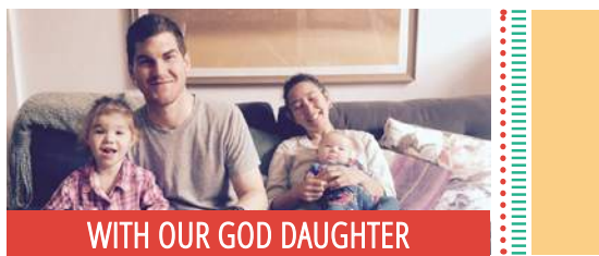
WITH OUR GOD DAUGHTER