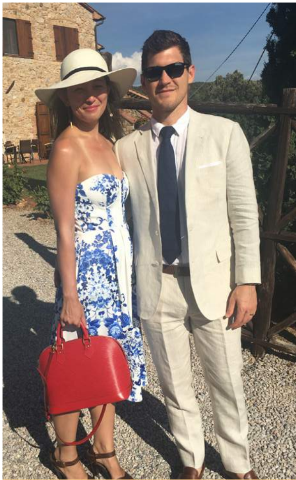
SO SUNNY IN ITALY