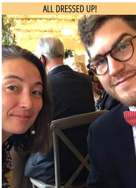
ALL DRESSED UP!