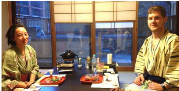
A TRADITIONAL JAPANESE HOT-SPRINGS DINNER