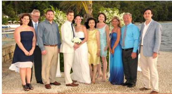
OUR JAMACIAN WEDDING DAY