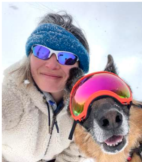
ALL SMILES IN THE SNOW!