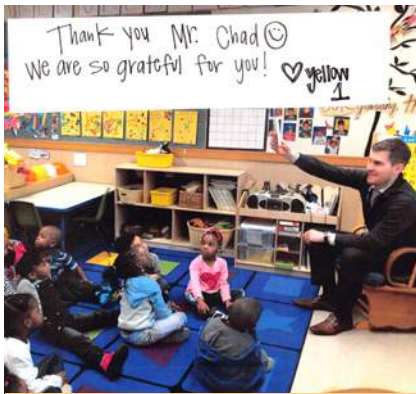
CHAD'S WEEKLY READING TO A CLASS