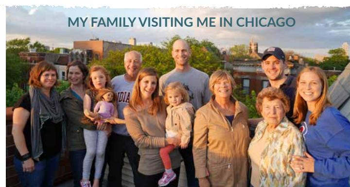
MY FAMILY VISITING ME IN CHICAGO

I am the oldest of 4 children and my parents (Nana and Grandpa) have been married for 46 years. My family is caring, active and generous with their time, money and actions. My siblings and I were raised to be respectful, responsible and patient. We were taught to value reading and education. I will strive to pass on all of these values to your child. I grew up going to both Methodist and Presbyterian churches; attending church on Sundays was routine for my family.