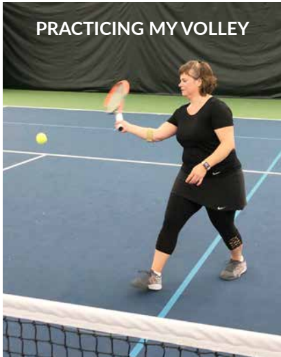
PRACTICING MY VOLLEY

The FAMILY CHAMPS! My brother-in-law and I beat my sister and brother at tennis!