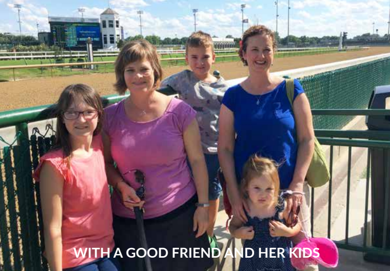
WITH A GOOD FRIEND AND HER KIDS