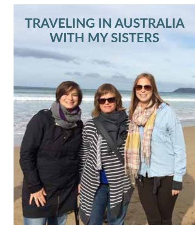
TRAVELING IN AUSTRALIA WITH MY SISTERS