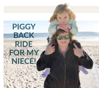
PIGGY BACK RIDE FOR MY NIECE!