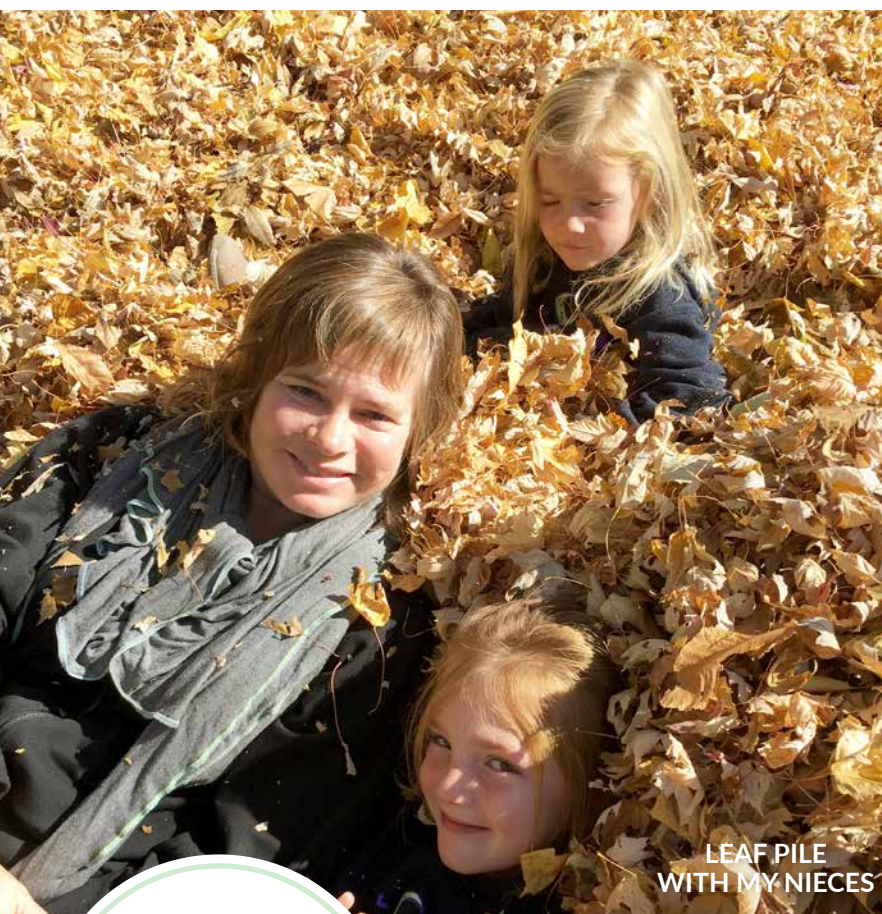
LEAF PILE WITH MY NIECES