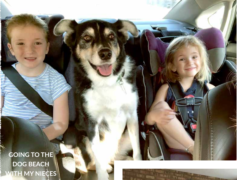
GOING TO THE DOG BEACH WITH MY NIECES

Aja is a loyal, fun and loving dog. She is always up for a walk or for chasing down a stick or ball in the yard. Aja loves to go on “vacation” to my parents’ house and lay around in the grass in their backyard (while guarding the yard for squirrels and wildlife). She is protective of those in her family and always has her eye on “her people” when lying in the corner of a room. AJA WILL TAKE HER JOB OF PROTECTING THE NEWEST MEMBER OF MY FAMILY VERY SERIOUSLY!