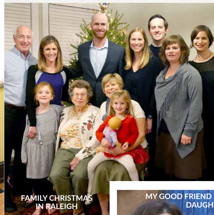
FAMILY CHRISTMAS IN RALEIGH