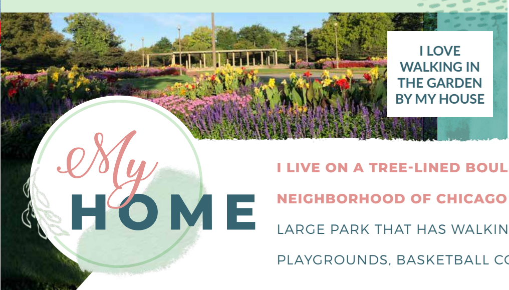
I LOVE WALKING IN THE GARDEN BY MY HOUSE

I LIVE ON A TREE-LINED BOULEVARD IN A DIVERSE NEIGHBORHOOD OF CHICAGO THAT IS A HALF BLOCK NORTH OF A LARGE PARK THAT HAS WALKING PATHS, LAGOONS, TENNIS COURTS, PLAYGROUNDS, BASKETBALL COURTS, BASEBALL FIELDS, ETC.