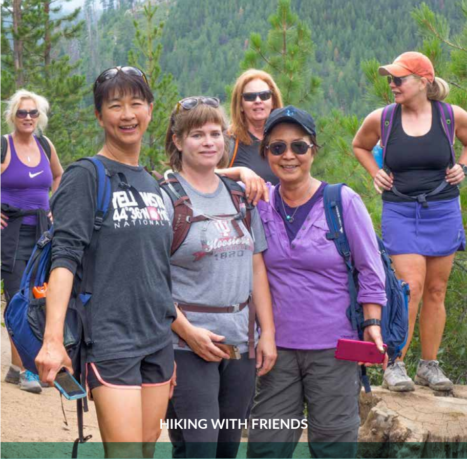
HIKING WITH FRIENDS

I LOVE TO HIKE AND EXPLORE THE OUTDOORS. I have hiked to the summit of two mountains in the Pacific Northwest. I enjoy exploring National Parks with my family. Our vacations usually involve outdoor exploration such as hiking at Lake Tahoe, walking on the beach at Hilton Head or swimming in Mexico.