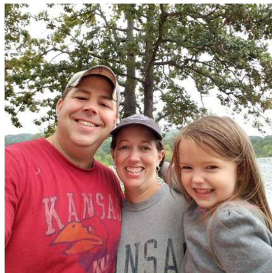
FAMILY CAMPING TRIP