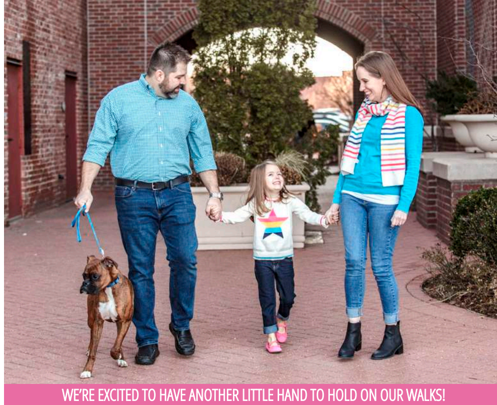
WE'RE EXCITED TO HAVE ANOTHER LITTLE HAND TO HOLD ON OUR WALKS!