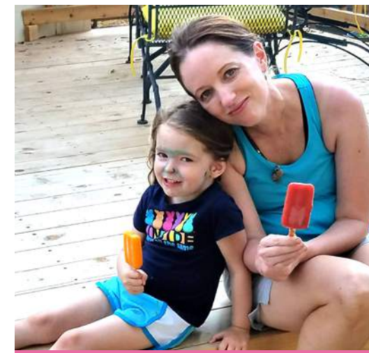
WE EAT A LOT OF POPSICLES IN THE SUMMER