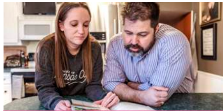
WHAT SHOULD WE MAKE FOR DINNER?