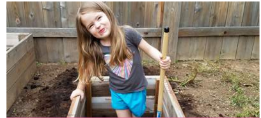
THE BEST GARDEN HELPER