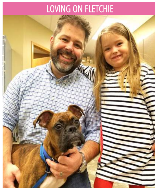
LOVING ON FLETCHIE