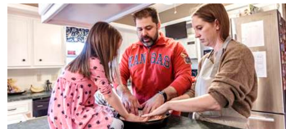
MAKING FOCACCIA, YUM!