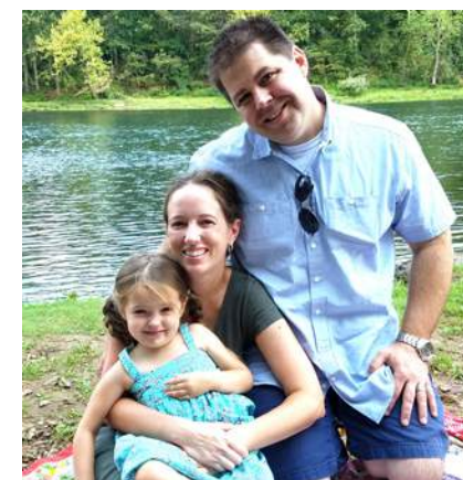
PICNIC AT OUR FAVORITE SPOT