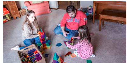
NOWHERE WE WOULD RATHER BE