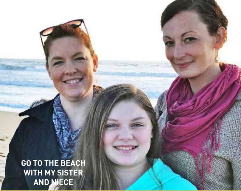
GO TO THE BEACH WITH MY SISTER AND NIECE