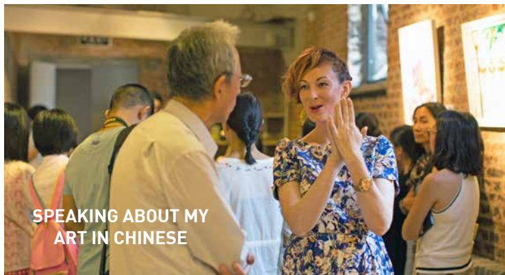
SPEAKING ABOUT MY ART IN CHINESE