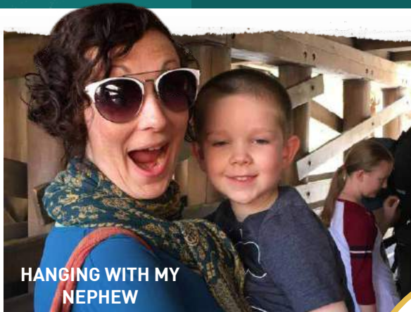
HANGING WITH MY NEPHEW

I especially want to let you know how great my parents are as grandparents. They are always at my niece and nephews' sporting events and concerts. They are passionate environmentalists and have instilled in me a respect for the planet. While I've lived in big cities most of my adult life, most of the rest of my family, including my parents, siblings, aunts, uncles, and grandmother, all live either in the countryside or in smaller villages. Overall, my family is down to earth, straightforward, caring, and incredibly supportive.