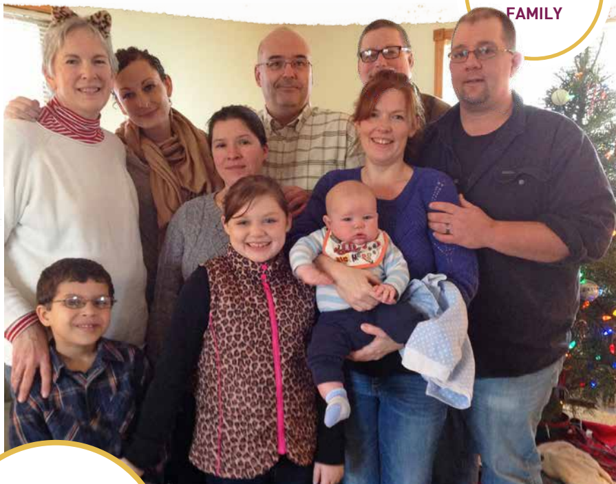
CHRISTMAS WITH MY FAMILY

I am super close with my two sisters, two nephews, and one niece. One of my sisters loves Disney, so we often take family trips there with the kids. It's a blast going on the rides together, sampling foods, and just spending the day together. Our family also likes to visit DC. We try to go about once a year, to soak in all the history and culture the capital has to offer.