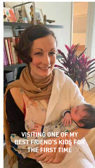
VISITING ONE OF MY BEST FRIEND'S KIDS FOR THE FIRST TIME