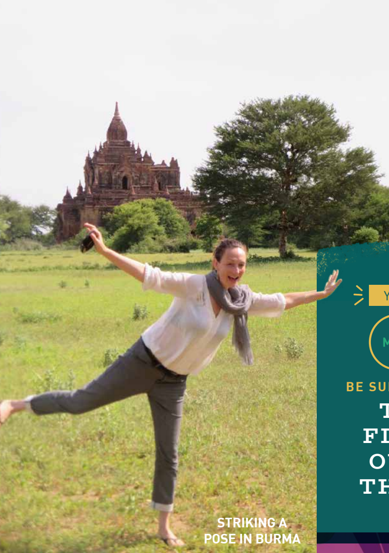
STRIKING A POSE IN BURMA