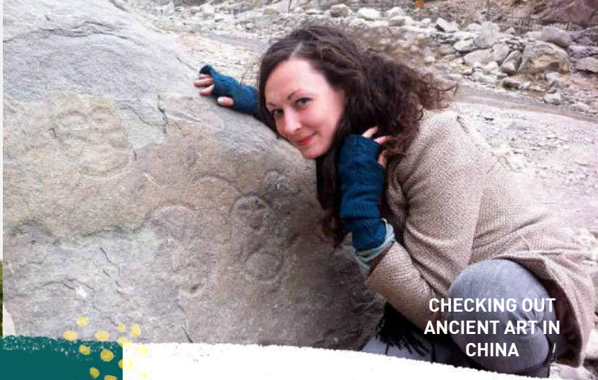
CHECKING OUT ANCIENT ART IN CHINA