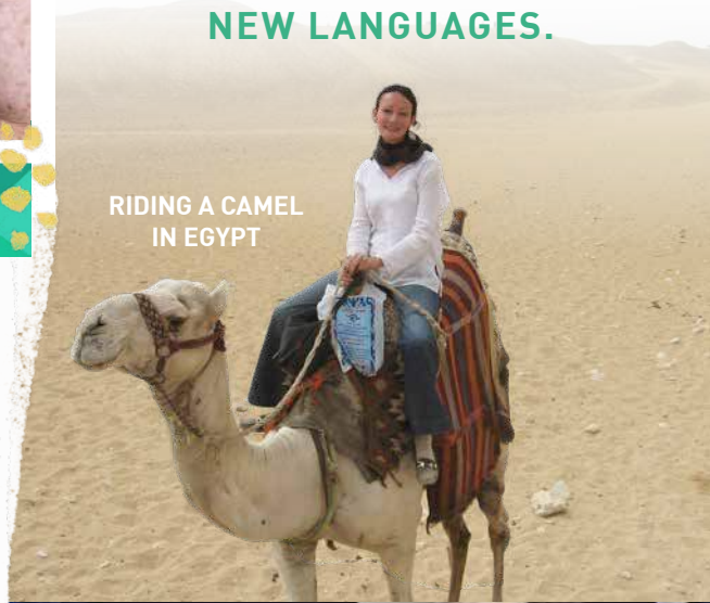
RIDING A CAMEL IN EGYPT

I AM Passionate ABOUT MAKING ART, GET EXCITED ABOUT COOKING, ENJOY NATURE, VOLUNTEER MY TIME, AND LIKE LEARNING NEW LANGUAGES.