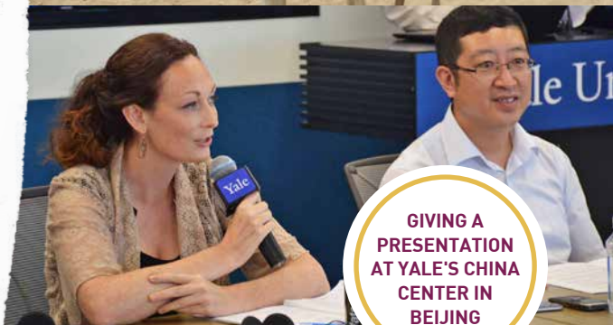
GIVING A PRESENTATION AT YALE'S CHINA CENTER IN BEIJING