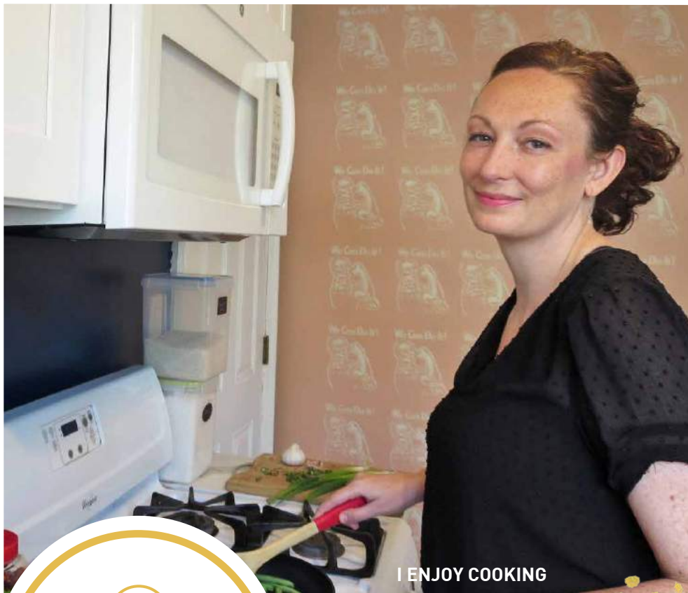
I ENJOY COOKING